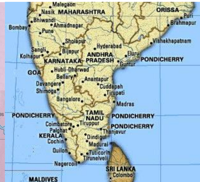
Figure 1. The Nilgiri Hills are located in the western part of Tamil Nadu, at the junction of Karnataka and Kerala, and are part of the Western Ghats mountain chain and Deccan Plateau. The area is bounded on the north by Karnataka State, on the east by Coimbatore District, on the south by Coimbatore District and Kerala State, and on the west by Kerala. The principal town and administrative headquarters of the Nilgiris District is Udhagamandalam, known formerly as Ootacamund (and colloquially as Ooty); other towns include Aruvankadu, Coonoor, Gudalur and Kotagiri.