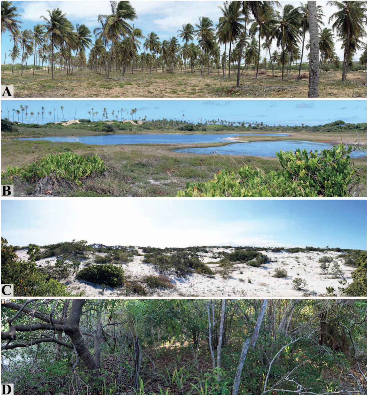
Figure 2. Restinga vegetation habitat types: (A) beach; (B) wetland; (C) shrub; (D) restinga dry forest.

The estimated species richness was calculated only on the basis of species obtained during fieldwork, considering each survey as a sample. Additional species from museums were not included in the analyses. We used the non-parametric estimator Chao 1 based on the total observed