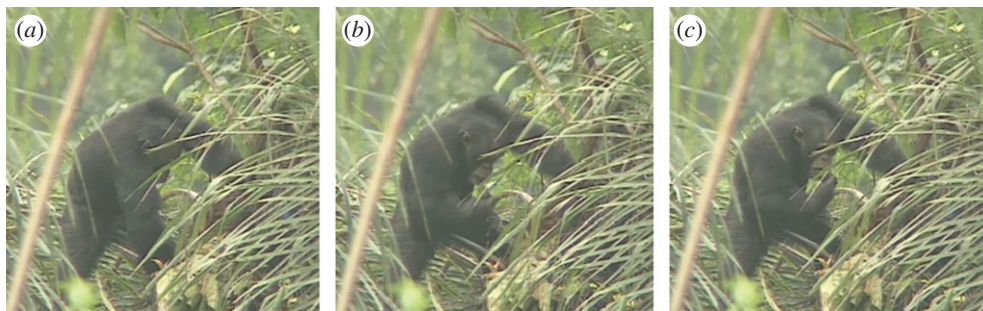
Figure 2. Adult male chimpanzee (FF) uses a leaf tool to drink raffia sap from a container (see also electronic supplementary material, video S1): (a) FF inserts right hand holding the leaf tool into the fermented palm sap container, (b) retrieves the leaf tool that is soaked in fermented palm sap and (c) transfers the soaked leaf tool to his mouth to drink the palm sap it carries (28 December 1996, see electronic supplementary material, table S2, session 2).