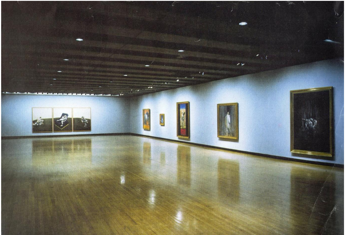
9. Installation shot, 'Francis Bacon: The Human Body', Hayward Gallery, 1998.