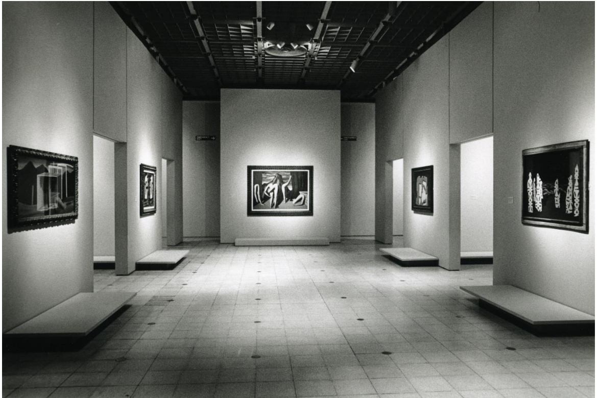
3. Installation shot of Magritte exhibition, Hayward Gallery, 1992; Ent'racte (1927) centre.