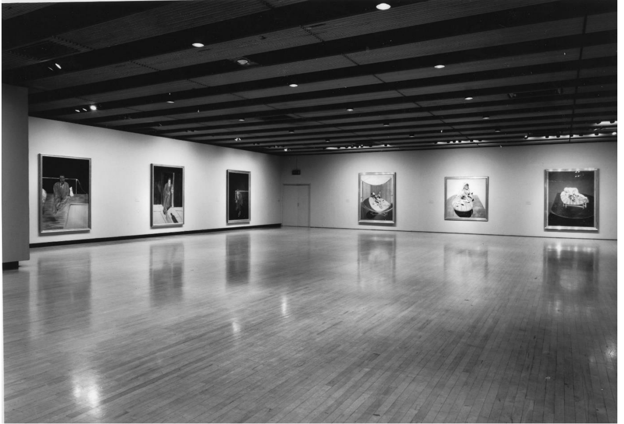
11. Installation shot, 'Francis Bacon: The Human Body', Hayward Gallery, 1998.