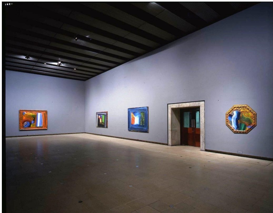
8. Installation shot, Howard Hodgkin exhibition, Hayward Gallery, 1996.