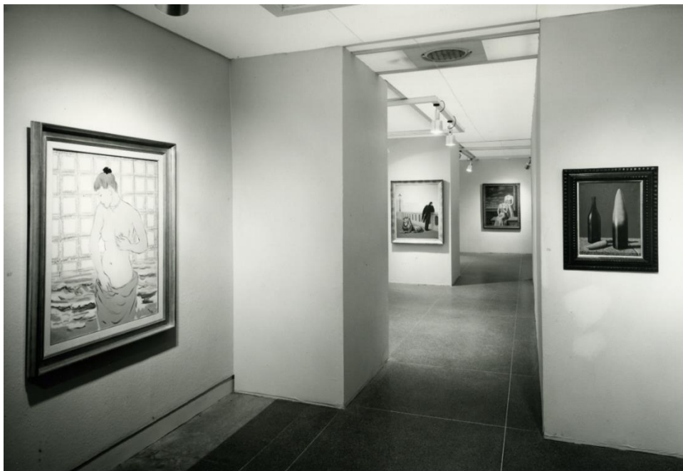
2. Installation shot of Magritte exhibition, Tate Gallery, 1969.