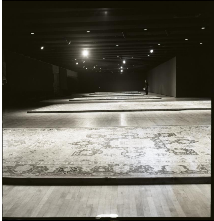
1. Installation shot, exhibition of Islamic carpets from the Joseph V. McMullan collection, Hayward Gallery, 1972.