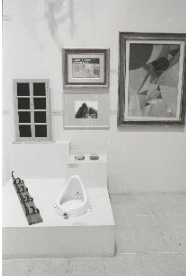
13. Installation shot, 'Dada and Surrealism Reviewed', Hayward Gallery, 1978, module two ( 291 , The Ridgefield Gazook , The Blind Man , Rongwrong , TNT , New York Dada ).