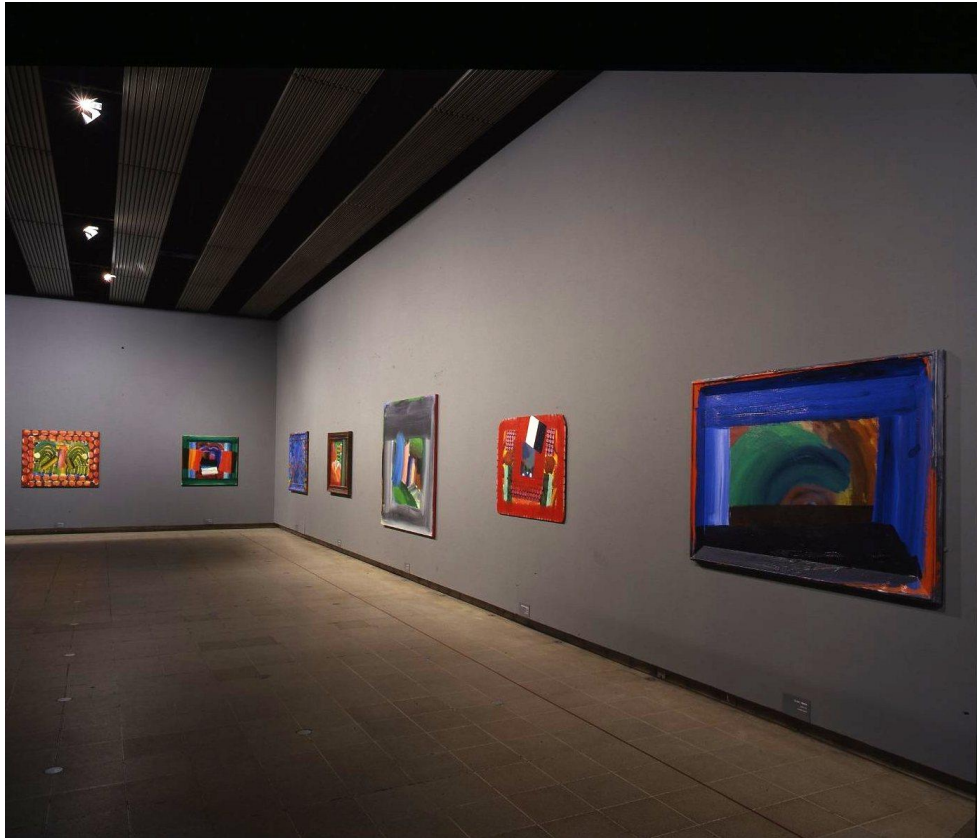
7. Installation shot, Howard Hodgkin exhibition, Hayward Gallery, 1996.