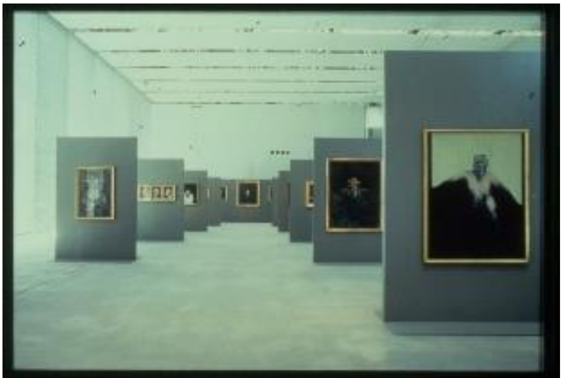
6. Installation shot, 'Trapping Appearance: Portraits by Francis Bacon and Alberto Giacometti from the Robert and Lisa Sainsbury Collection', Sainsbury Centre for Visual Arts, 1996.