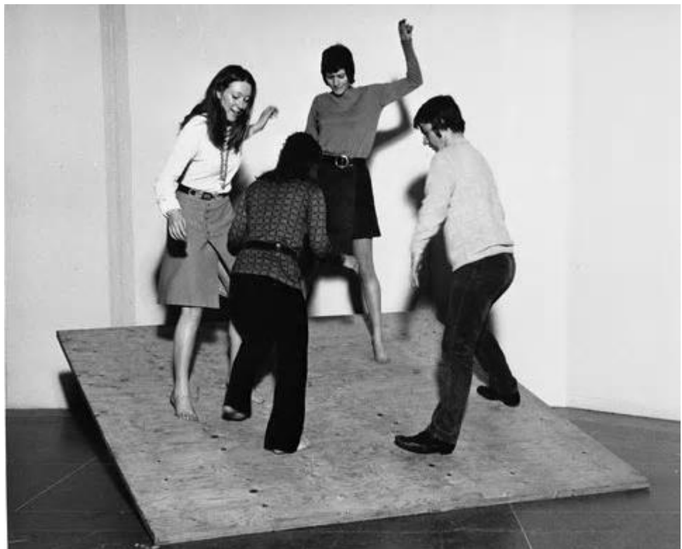
12. Installation shot, Robert Morris exhibition, Tate Gallery, 1971.