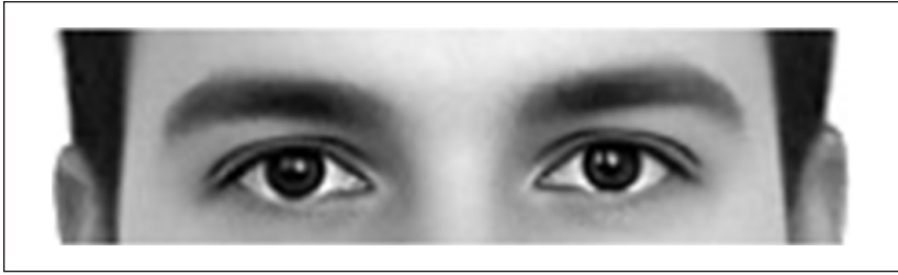
Figure 4. “Watching Eyes” manipulation (Experiment 1).

to the railway level crossing. After the barrier dropped and vehicles were all stationary, research assistants walked along the sidewalk, recording whether each vehicle’s engine was on or off.