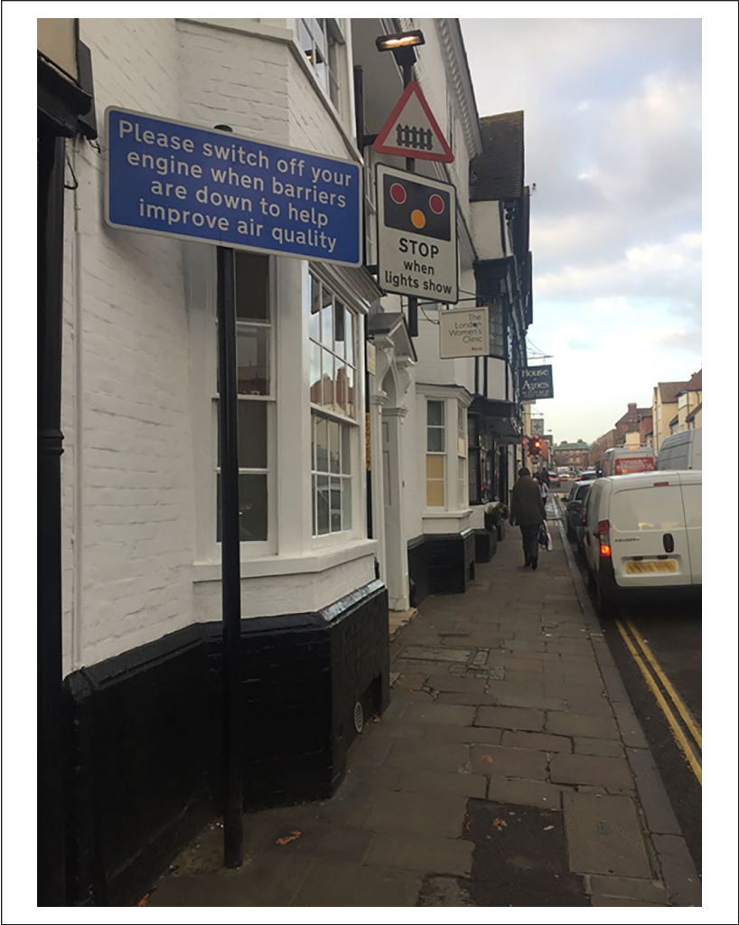
Figure 3. Permanent sign at the level-crossing site, placed by the local council.