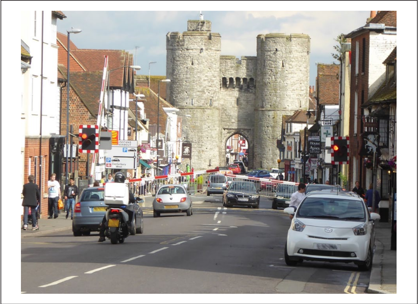
Figure 1. The level crossing and surrounding area.

stake, because maintaining a reputation as a cooperative person is necessary for survival in a social system (Burnham & Hare, 2007; Haley & Fessler, 2005). Thus, subtle surveillance cues, such as the watching eyes, can induce cooperative behavior. Subsequent research has shown that images of eyes can increase people's donations to a charity bucket (Powell, Roberts, & Nettle, 2012), their decisions to recycle appropriately (Francey & Bergmuller, 2012), reduce their littering (Bateson, Callow, Holmes, Redmond Roche, & Nettle, 2013; Ernest-Jones, Nettle, & Bateson, 2011), and deter them from stealing from public bicycle racks (Nettle, Nott, & Bateson, 2012). Even eye-like spots displayed on a computer screen have been shown to increase cooperative behavior within economic games (Haley & Fessler, 2005; Rigdon, Ishii, Watabe, & Kitayama, 2009).