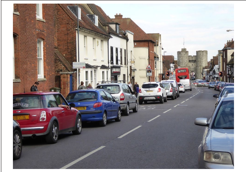
Figure 2. Example of queuing traffic when barriers are down.

level crossing is located in the shopping district in the city center on a road lined with shops and cafes. It is part of a major through route to the rail station and to the main city center bus stops. As such, it is heavily congested by both road traffic and pedestrians. During the period in which these experiments were conducted, the annual mean concentration of nitrogen dioxide at our level-crossing site was 39 \mu\text{g}/\text{m}^3 (Medway Council, 2013) only just meeting the European Commission Air Quality target of 40 \mu\text{g}/\text{m}^3 (European Commission, 2014). To encourage drivers to turn off their engines while waiting at the level crossing, Canterbury City Council had placed a permanent sign at the crossing (see Figure 3). Although some research suggests that signs alone can change behavior (e.g., McNeese, Egli, Marshall, Schnelle, & Risley, 1976; Thurber & Snow, 1980), the message on this sign was designed simply to be an informational request and was not guided by any particular behavioral theory (Canterbury City Council, personal communication, November 3, 2016). Perhaps, owing to the absence of surveillance cues, the existing sign produced low levels of compliance (see baselines). In these experiments, we implemented additional types of surveillance cues in an attempt to increase compliance with the instruction to switch off engines.