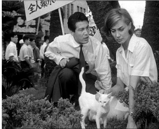
Figure 5. Alain Resnais, Hiroshima mon amour , 1959

journey in the centre. These sequences, and possibly the whole film, are the prime example of urban metaphors.