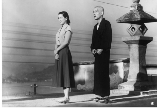
Figure 4. Yasouro Ozu, Tokyo Story , 1953

In Ozu's portrayals of Japanese cities in the 1950s, the "pillow shots" have a structure that often includes a poster or a sign in the first plan while the background contains movement. The movement is generally slow and sometimes interlaced with signs; rare pedestrians meander around city corners. Sharp-angled perspectives with layering of void spaces are deployed for the depth of the picture containing gentle strata of shimmering lights, occasional unhurried movement of people and vehicles, floating drapery etc. Shadows are often from the side and under approximately forty five degrees. Characters are implied by their absences. The shots capture time and its passage suggesting the transcendence of the city space 'Fig. 4'.