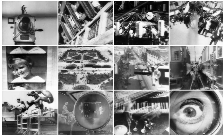
Figure 1. 1 Dziga Vertov Man with the Movie Camera (1929)

inventive power of the new medium. In these ground breaking works by both directors we also sense the cross-fertilisation with other disciplines.