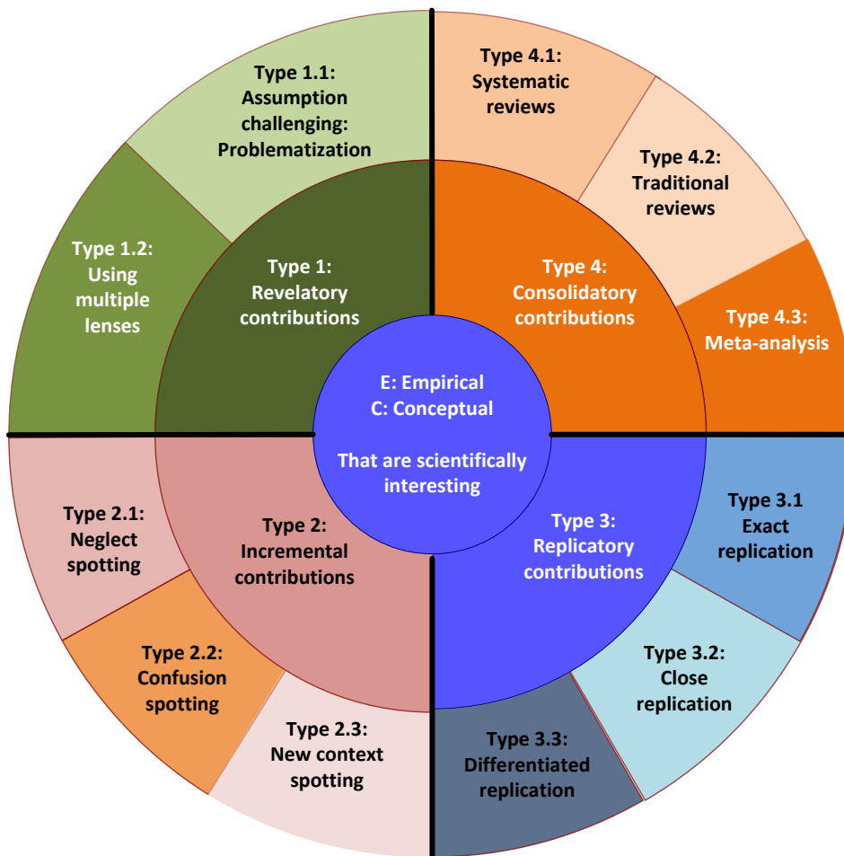
Fig 1: Conceptual model: Dimensions of contribution in Industrial Marketing

The framework has four broad categories and a series of sub categories developed from the preceding analysis and discussion. Each contribution can be split between mutually exclusive conceptual (only) and empirical (non-bibliographic), hence they appear at the centre of the model. This inclusion allows for further consideration as to which types of contribution strategy are used relative to whether a paper is conceptual or empirical, a consideration here for us was whether revelatory contributions tend to be made in conceptual contributions rather than empirical ones.