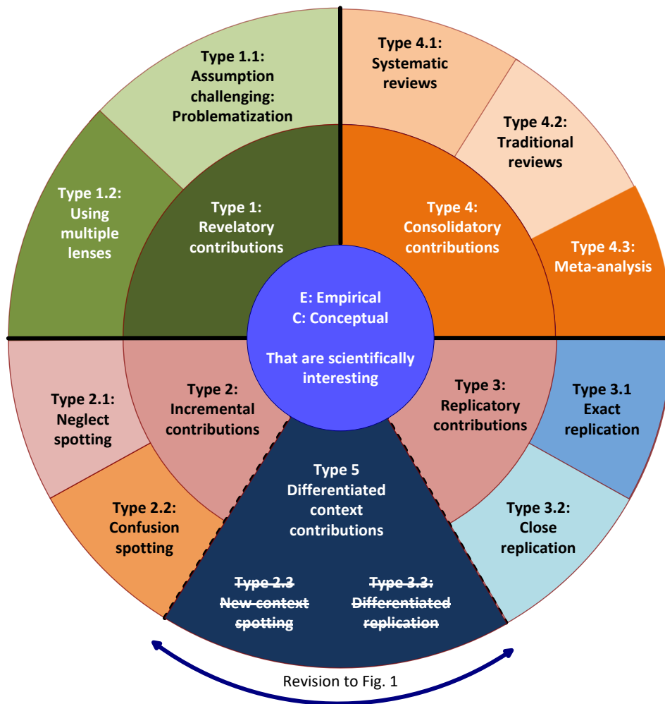
Figure 3: Final conceptual framework:

In completing the confidence checks in phase 3, we find the model to be secure in respect of there being no further categories in the sampled papers that we failed to identify, and that an analysis of introductions and abstracts really did capture the contributions made in the body of the papers in the sample. We further identify some under-claiming by authors. We do, however suggest some caution with regard to the distinction between sub-categories 2.3 and 3.3 and suggest further development of this approach couched in semantic terms associated with differentiated replication. We therefore show these categories in our final conceptual framework as merged.