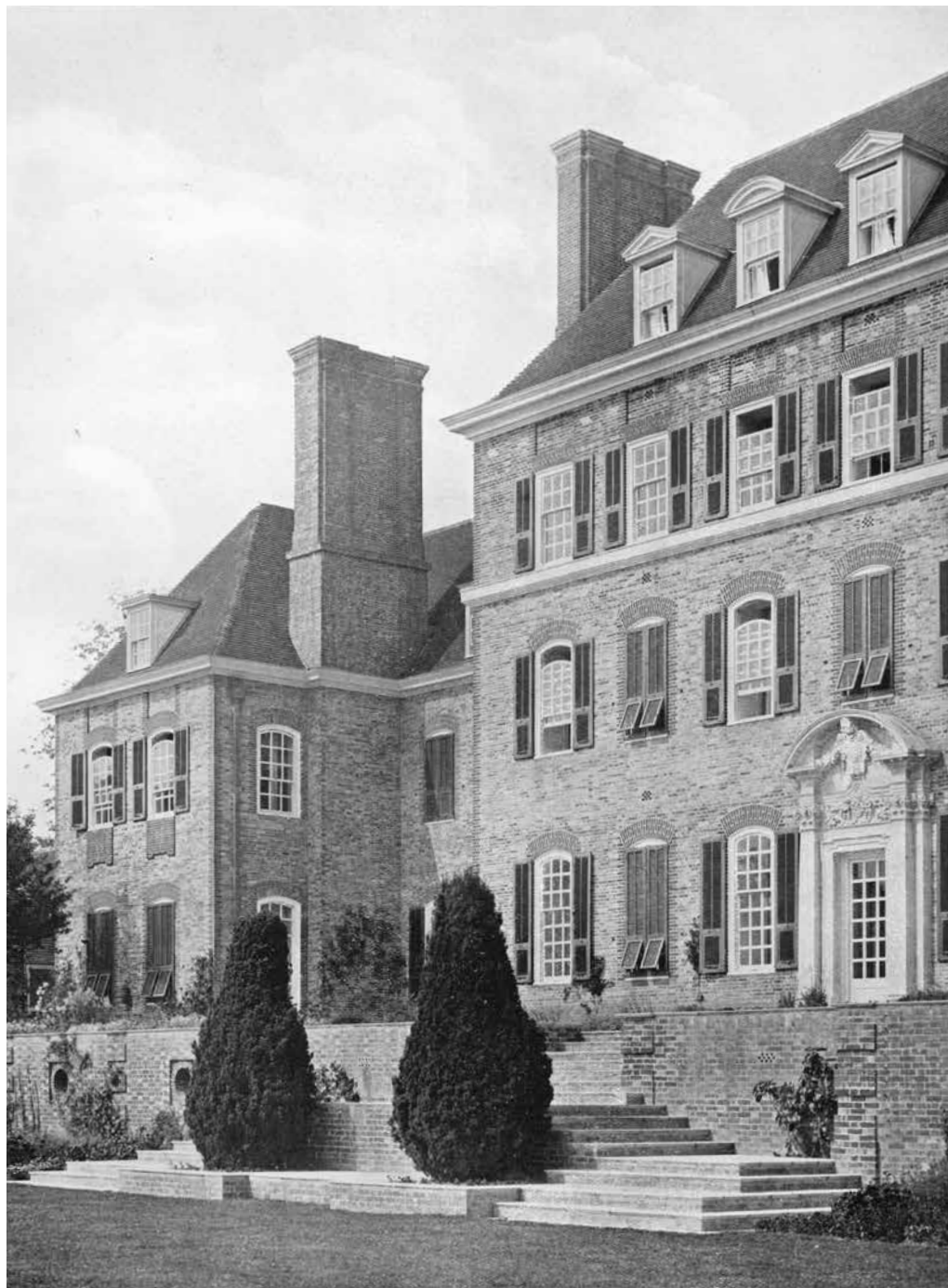
Edwin Lutyens, garden elevation, Great Maytham, Rolvenden, Kent, 1909 From Lawrence Weaver, Houses & Gardens by EL Lutyens, 1913