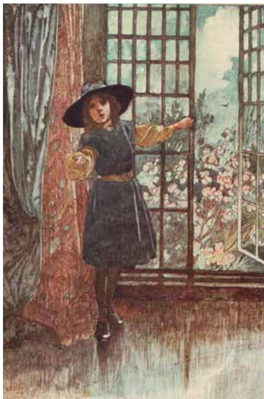
Illustration by Charles Robinson for Frances Hodgson Burnett's, The Secret Garden , 1911