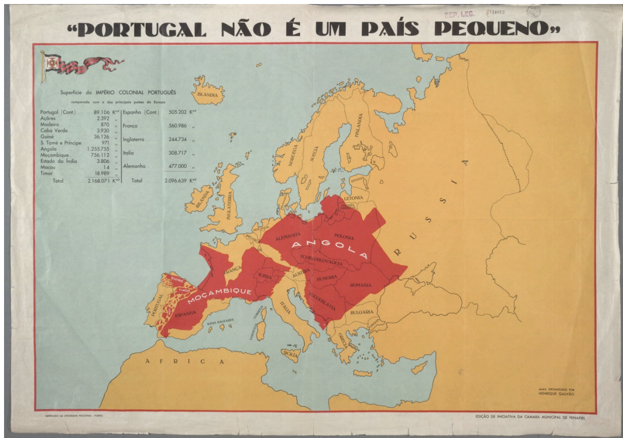
Figure 1. “Portugal is not a small country” – Henrique Galvão, c. 1935, Câmara Municipal de Peniche.

“Portugal is not a small country.” In Portugal, this poster-map, where the country’s colonial possessions at mid-twentieth century are superimposed in red upon the map of Europe, continues to have a succès de scandale – one of the most famous instances of the kind of vacuous imperial bravado that my generation of left-leaning anticolonialists so deplored (Vale de Almeida 2004 and Vale de Almeida et al 2006). The map was conceived and produced in the mid-1930’s by one of the more extraordinary figures of the period: Henrique Galvão was the most inspired propagandist of the early fascist regime and of Portugal’s African empire. At the time, he was the founder and first director of the National Radio Agency and a very widely read writer of colonialist