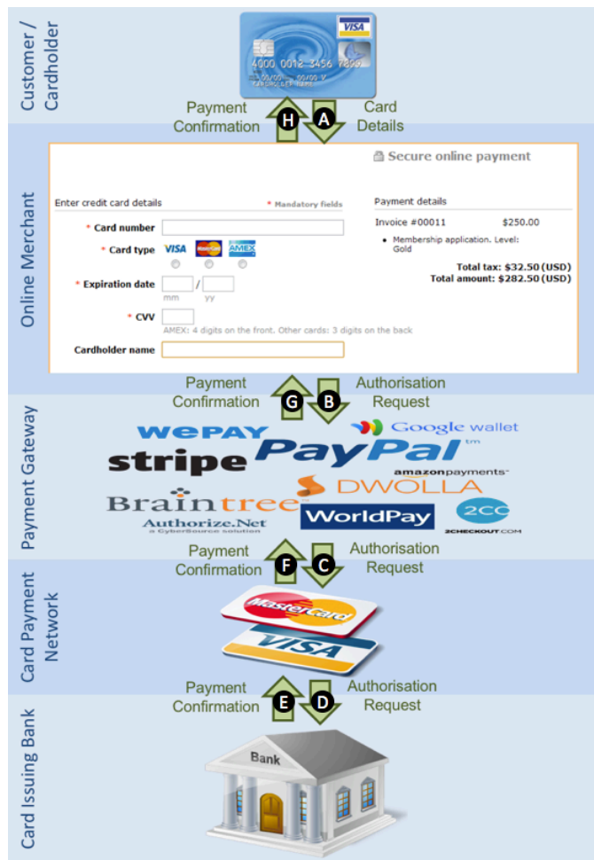
Fig. 1. Actions and parties in online payment.

An online payment site uses a customer's existing credit or debit card to transfer funds from the customer's bank account into the merchant's bank account. For this to happen, the customer needs to provide their card information during checkout. These pieces of information are then passed to the card issuing bank, who will process the information further before authorising or rejecting the payment request. This process involves a number of parties, each with different responsibilities.