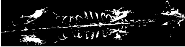
Fig. 2 A 2D projection from a 3D scan of a Bison [9] of n = 2108416 points in a 2D grid of 5510 \times 1366 , reduced to s = 11020 points by the method.

the end of the routine, M = [1, 0, 1, 0, 1] indicating there were gaps in array L at x positions 2 and 4. The idea is now to extract from M the 1's, skipping the 0's in as many steps as 1's in M . Such extraction is accomplished by considering M as a binary number m and applying the recurrence m_j = m_{j-1} \text{ AND } (m_{j-1}-1) [7]. The procedure is illustrated in Table 1. A '1' position in M is computed as pos = \log_2(m_{j-1}-m_j) and index in L as x = p - pos . In three iterations, x indices 5, 3, 1 are recovered, these correspond to positions in this small example, where L has valid points, skipping empty positions 2 and 4. Note that the procedure takes O(k) time, where k is the number of 1's in M , k \leq p . As n < p , k = n in this case, the method remains O(n) . However, this has the cost O(p) in memory space complexity. If p size is too large the conversion of the binary string M to the decimal m is impractical. In this case, M can be blocked into strings of size r and the whole procedure remains O(n) , as explained in [8]; an explicit call to \log_2() function is not needed either. Block sizes of r = 32 or 64 are practical since m can be directly expressed as integers or long integers in current processors.