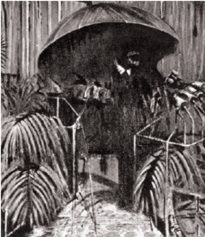
23. Study for a man with microphones , by Francis Bacon. 1946 (subsequently over-painted). Canvas, 145 by 127.8 cm.

such compelling effect on the tubular metal podium in front of his generic fascist dictator.