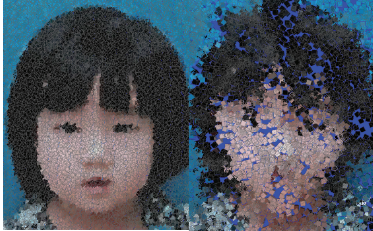
Fig. 1. Left: the original image is segmented into many small cubes. Right: these cubes are animated using the boid framework.