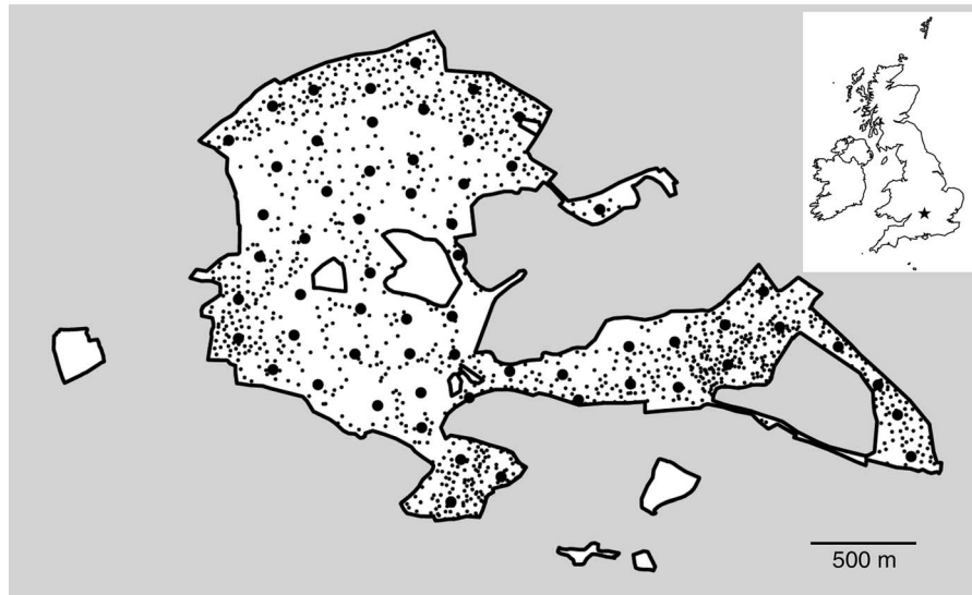
FIG. 1. The location of data loggers (large circles) and nest boxes (small circles) in Wytham Woods, UK (latitude and longitude: 51.77, -1.34 ). Inset shows the location of Wytham Woods (star) within the British Isles.

2005, Gienapp and Bregnballe 2012). These trends are often attributed to higher quality individuals being better able to absorb costs associated with arriving earlier than what might, strictly, be optimal for breeding if there was no competition. By arriving early, these individuals may gain a substantial competitive advantage associated with prior occupancy of breeding territories.