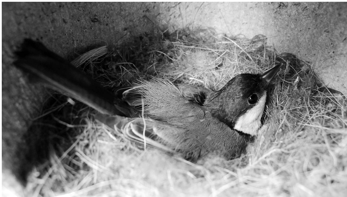
PLATE 1. Adult (older than 1 year) female Great Tit (Y161635) brooding seven two-day-old chicks at box WB04 in Bagley Wood (UK) on 16 May 2013.

Our model estimated that \sim 10\% of all individuals that were available for detection over the course of the study period (the super-population) were present in the woods when monitoring began in early August. This corresponds to \sim 100 females, half of the number of resident individuals that are known to have subsequently bred. By mid-November just over 80% of the super-population had arrived. Between this time and late March very few individuals entered the population. The remaining 10–15% of individuals arrived during the final weeks of monitoring, prior to the BS. The shape of the cumulative sum of entry parameters (Fig. 3a) suggests that arrivals occurred in synchronous waves; large at the beginning of the NBS, followed by a period of stability, and then a final smaller wave at the end of the NBS. Week-to-week apparent survival probabilities were very high ( >0.98 ), suggesting that once individuals arrived they tended not to leave the woods. Early arrival at the woods during the NBS was a strong predictor of successfully reaching the incubation stage of nesting. We found some evidence for weak effects of arrival time on fledging success.