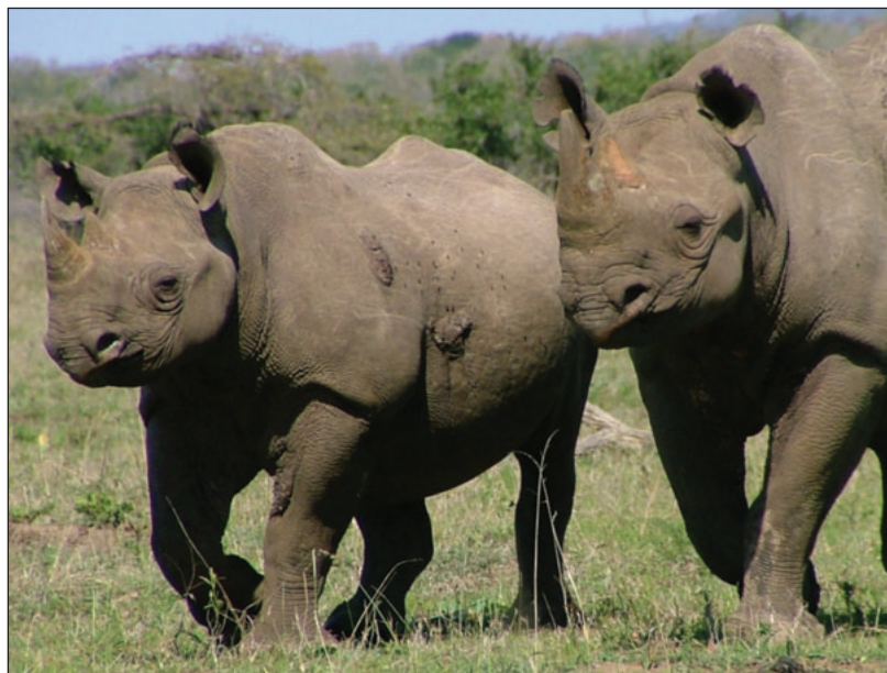
Figure 2. Black rhinoceros ( Diceros bicornis ) populations have benefited greatly from metapopulation management through translocation. Excellent record-keeping by government biologists and private partners has enabled the resulting data to be analyzed and applied for management.