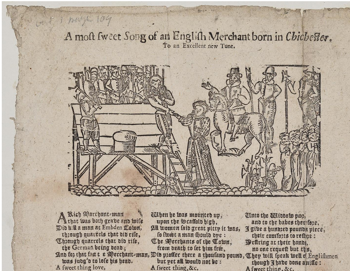
Figure 2. 'A most sweet Song of an English Merchant', University of Glasgow Library Euing 230, EBBA 31745. Note the detailed dress of the protagonists in the woodcut.

His Stockings were of silk as fine as fine might be, Of person and of Countenance, a proper man was he 9