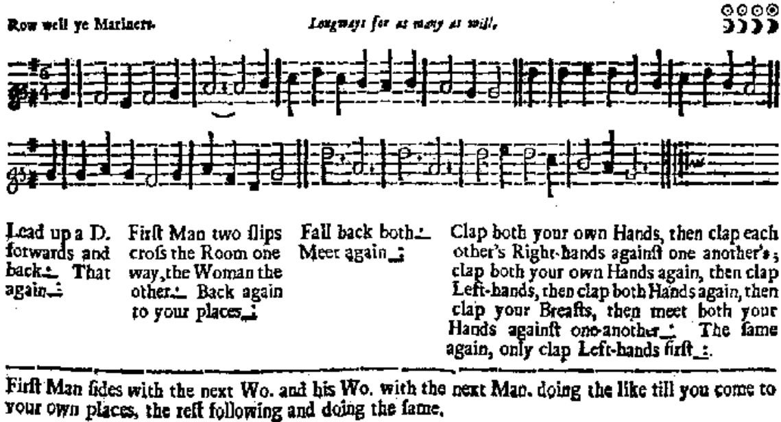
Figure 3. Dance instructions to ‘Row well ye Mariners’ in The Dancing Master: Or, Directions for Dancing Country Dances, with the Figure and tunes to each Dance. (London: John Playford, 1670).

hands, ‘do-si-do’-ing their partners, skipping around, and at the end of each verse stepping to the right so that they then dance with the next person in line (fig. 3). 70