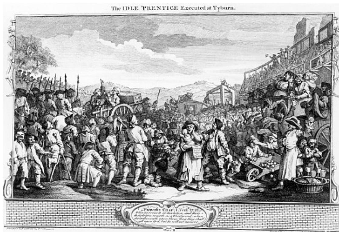
Figure 1. Thomas Hogarth, 'The Idle 'Prentice Executed at Tyburn'. From the series 'Industry and Idleness', 1747.

vendor who sings her wares, infant on one arm, 'The last dying Speech & Confession of—Tho. Idle' in the other [fig. 1].