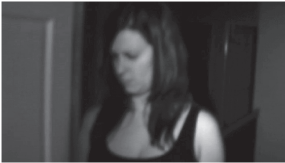
14 15 16 17 18 19 20 21 22 23 24 25 Figure 2. Katie enters the frame abruptly as Micah's camera meets her, out of focus in Paranormal Activity (Paramount, 2007).

5 6 Scanning Narrative Space. The continuity between the film and the surrounding 7 real in the first Paranormal Activity is partly due to the erratic camera work, to the frame's 8 ability to quickly incorporate what is off-screen into the shot, just as it can easily re- 9 legate what is in the shot to the off-screen. The suspense generated by Micah's frenzied 10 search for a sleepwalking Katie in the middle of the night, camera in hand, comes pre- 11 cisely from the apprehension about what the bumpy, tightly framed point-of-view shots 12 might encounter—the fast pace with which the handheld camera moves suggests that 13 whatever it finds is likely to invade the frame in abrupt fashion (Figures 2–5).