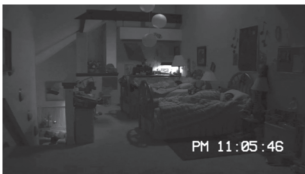
21 22 23 24 25 26 27 28 29 30 31 32 33 34 35 36 37 38 39 40 41 42 43 44 45 Figures 7 and 8. Not even a second elapses when we move from living room to bedroom, but spaces are still shown to us successively, rather than simultaneously. Paranormal Activity 3 (Paramount, 2011).

So the audience's advantageous stand-point over the paranormal activity comes less from the illusion of control associated with spatiotemporal continuity than from the antecedence of viewing: our ability to witness sounds of foot-steps, a moving door, banging and thudding, lights switching on and off, passing shadows, and floating sheets precedes the perspective of the characters, who need to wait until the next morning to watch the recorded footage (which they do even when these events are seen as they happen).