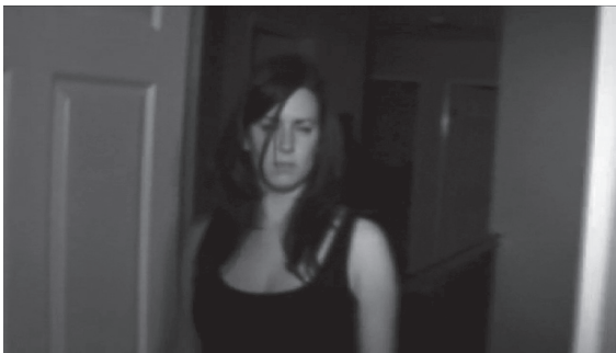
26 27 28 29 30 31 32 33 34 35 36 37 Figure 3. Micah's hesitant camera then adjusts distance and focus to 38 get a clear image of her, first zooming out . . .

39 the frame may reveal that best describes the motivation for such scanning. The takes 40 of Katie and Micah sleeping frame the couple's bed on the center-right side and the 41 bedroom door on the left (Figure 6). Although characters tend to attract the viewer's 42 gaze, the expectation about seeing evidence of paranormal phenomena invites us to 43 instead scan the whole of the frame, until the door's movements and the passing of