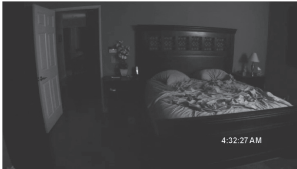
Figure 9. Paranormal Activity (Paramount, 2012): The action takes place in the dark background, directing our gaze to a vanishing point and leaving the room empty of figures.

physical location in a space framed by a long take and a long shot, and from a static camera, as well as in this action's relative invisibility. Still, by attracting our gaze to a corner while foregrounding a space devoid of character and movement, this shot expands the frame's territory by bringing the background into relevance. 50