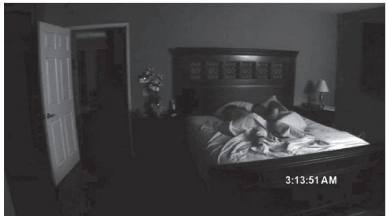
Figure 6. Static shots taken from the camera on a tripod are long in duration and invite us to look away from characters and scan the image for the manifestations of the supernatural. Paranormal Activity (Paramount, 2007).

1 2 3 4 5 6 7 8 9 10 11 12 13 14 15 16 17 18 19 20 21 22 23 24 25 26 27 28 29 30 31 32 33 34 35 36 37 38 39 40