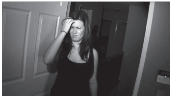
Figure 5. Until he finally manages to properly frame a sleepy and confused Katie, keeping her in the shot and in focus. Paranormal Activity (Paramount, 2007).