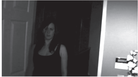
Figure 4. Then leaving her in the dark corner of the image as he moves right . . .

This awareness of what lies at the margins echoes both in Roger Cardinal's discussion of a "decentered scanning" of the film image and, more recently, in Evan Calder Williams's concept of horrible form. 41 Cardinal and Calder Williams analyze the implications of our attention to elements that rest, respectively, on the periphery and the background of the frame and which in both cases expand and enhance our perception of the image. In Cardinal's assessment, the presence of such elements may be accidental, such as a chicken that irrupts "for scarcely a second" in the background of a "propaganda film about hygiene" conceived for an African audience, or purposefully staged, such as Antonioni framing a car of agents in pursuit of the hero in an extreme long shot including "several incidents of negligible concern," such as children playing, at the end of The Passenger (1975). 42 These elements, which Cardinal deems "peripheral," exist outside of the narrative focus and at the same time move that focus away from the center and into the corners of the frame. They expand