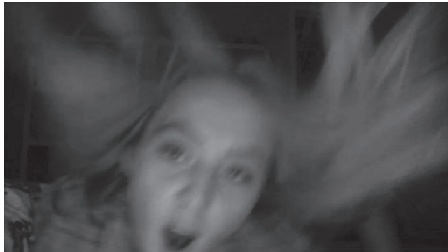
Figures 10 and 11. Paranormal Activity 4 (Paramount, 2012): The champs vide is long in duration and invites us to scan the whole of the frame, until Alex jumps back into shot and startles Ben (and probably the spectator).