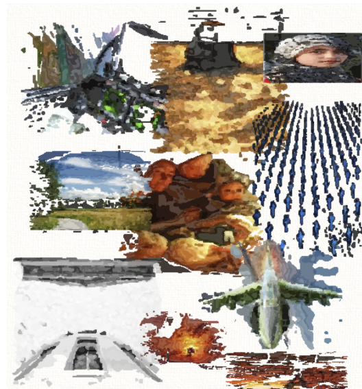
Figure 1. Collage generated by Cook & Colton's collage generation module in The Painting Fool system, on the theme of the current war in Afghanistan (Cook & Colton, 2011, Fig. 1, p. 2).

'There was the young lady called Bright . They could travel much faster than light . They relatively left one day . It survived . They left . On the night , she returned .' [17, p. 9] Where syllables are in bold, that syllable should be stressed when reading aloud the limerick.