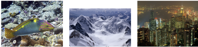
(a) Image A (b) Image B (c) Image C