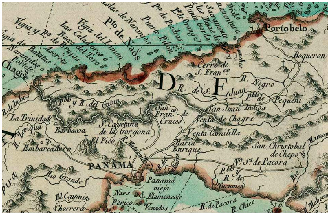
Figure 4. Fragment of Map of Tierra Firme or Castilla de Oro (Panama) in 1785, by Don Juan Lopez, showing the route of the Camino Real from Panama City to Portobelo, and the Chagres river (Source: Bibliothèque nationale de France, département Cartes et plans, GE SH 18 PF 143 DIV 10 P 6).

The Camino Real is the overland trail that connected the terminal cities on both oceans across the isthmus, Panamá on the Pacific and Nombre de Dios on the Atlantic. Its passage was swifter but much more expensive than travelling along the Camino de Cruces – the cheaper, longer, safer, more comfortable and better historically known route – which connected the same destinations but through a mixed terrestrial and fluvial way along the Chagres river. They were both used from the third decade of the 16 th century onwards, when the Camino Real was simply an open path through the jungles until it was partially paved at the end of the century. 82 These trails were crucial in maintaining the commercial, tributary and political links between Spain and its South American empire, and witnessed the passing of over 60% of all the gold and silver taken to Europe in the 16 th and 17 th centuries, 83 especially so over the Camino Real which was designated as the only possible