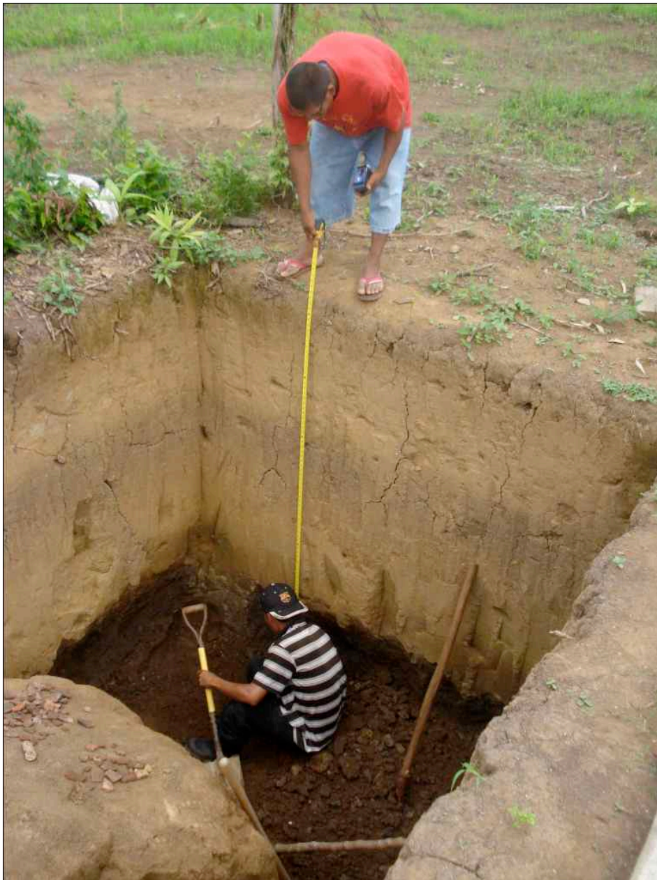
Figure 2. Five feet deep layer of ancient settlement in Tortuga, River Ucuganti.

assemblages, 63 64 even if the motifs seen in this sample were unknown or seldom seen, a fact which precluded a precise dating of the feature or the shreds.