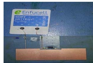
Fig. 1. Battery assisted transfer tattoo RFID tag.

The BAT chip was provided by EM Ltd. [5]. Battery energy is not used by the chip in the return wireless link to the reader, but the transponder receiver sensitivity is increased to different levels according to the chip operational mode. The sensitivities of the four modes are: -17, -22, -28 and -31dBm respectively. This results in significant read range enhancements at the cost of accommodating a battery on the tag and compromising the low profile and active lifespan. To reduce the impact on the tag profile, the battery was a 0.7mm thick technology marketed by Enfucell [6], and which is shown connected to the tattoo tag in Fig. 1. The tattoo tag dimension is 64mm x 20mm with a slot dimension of 19.5mm x 1.5mm.