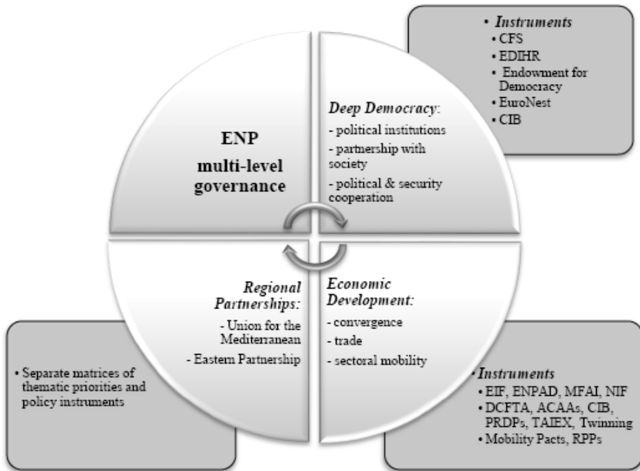
Figure 1. The ENP multi-level structure of governance