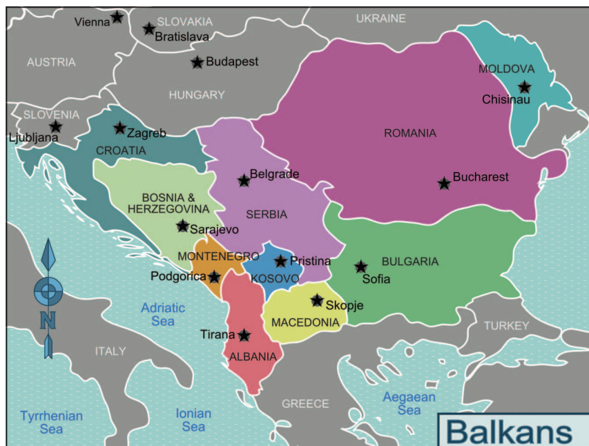
Image 1 Map of the Balkans.