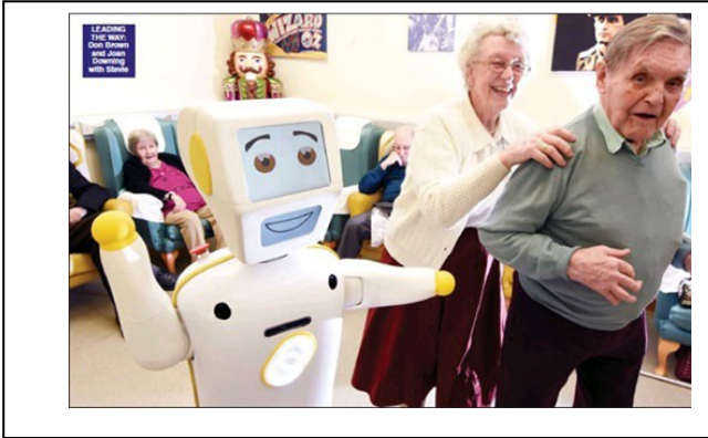
Figure 3. Guests dancing inspired by Stevie

There were four sub themes to whether the robot operated as expected: useful functions, Stevie 's features, individual differences, and inclusivity. Staff discussed Stevie 's useful