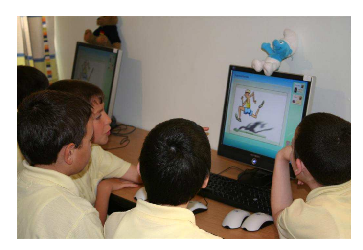
Fig. 3. Students attentively follow an educational slideshow presentation about nutrition

other through illustrations by means of an engaging Pictionary-like game which encourages collaboration and competitiveness amongst the students.