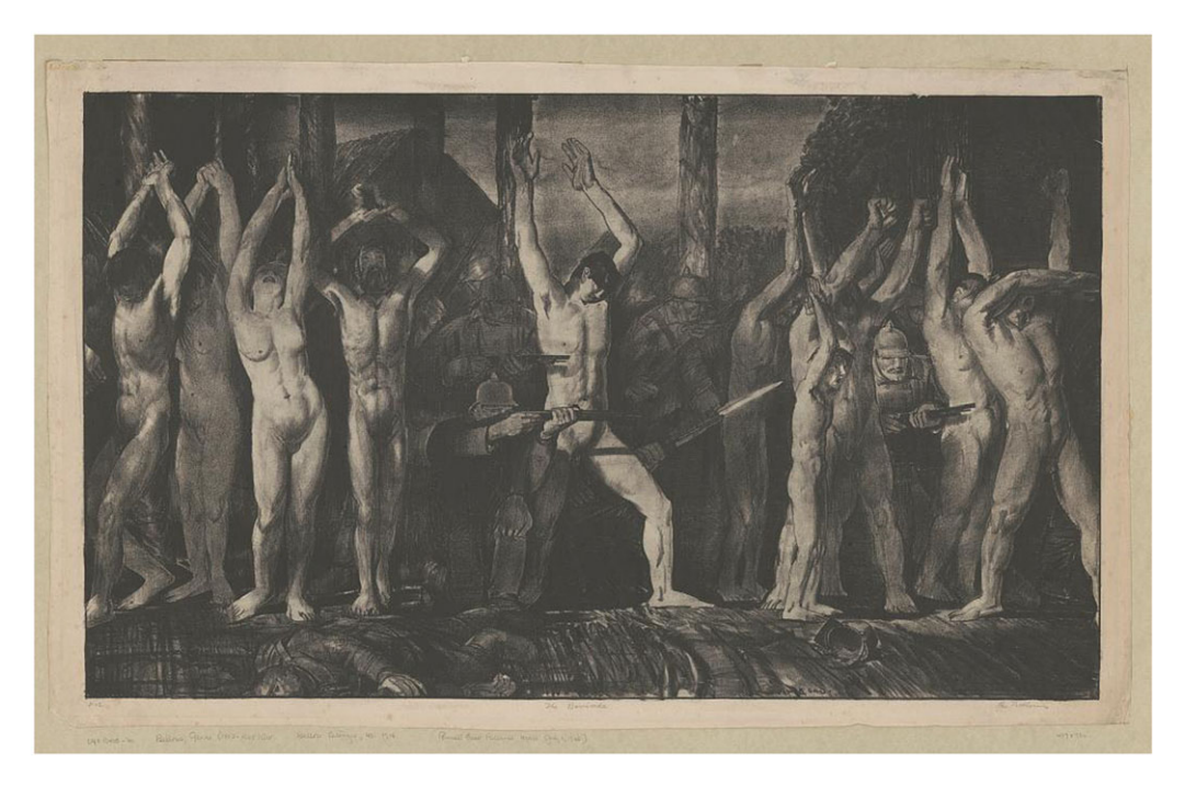
Figure 2. The Barricade, George Bellow, 1918. Library of Congress.

Figure 2 is a book cover of the first ever historical account of human shields.<sup>96</sup> It features George Bellows' artwork inspired by Germany's conduct during the First World War occupation of Belgium.<sup>97</sup> Again, we see guns but almost do not see the soldiers, who are relegated to a dark, shadowy background. Contrasted with the soldiers' protective uniform and foregrounded weapons, in the foreground we see a manifestation of vulnerability: naked human flesh, hands raised to the sky, and eyes reflecting despair, horror, or bewilderment. Not unlike Solomko's choice of a woman and a toddler to depict vulnerability, the 'exaggeratedly large arms and hands of the victims, which are raised to the sky' as if in a gesture towards prayer 'call attention to their subjugation and acquiescence'.<sup>98</sup>