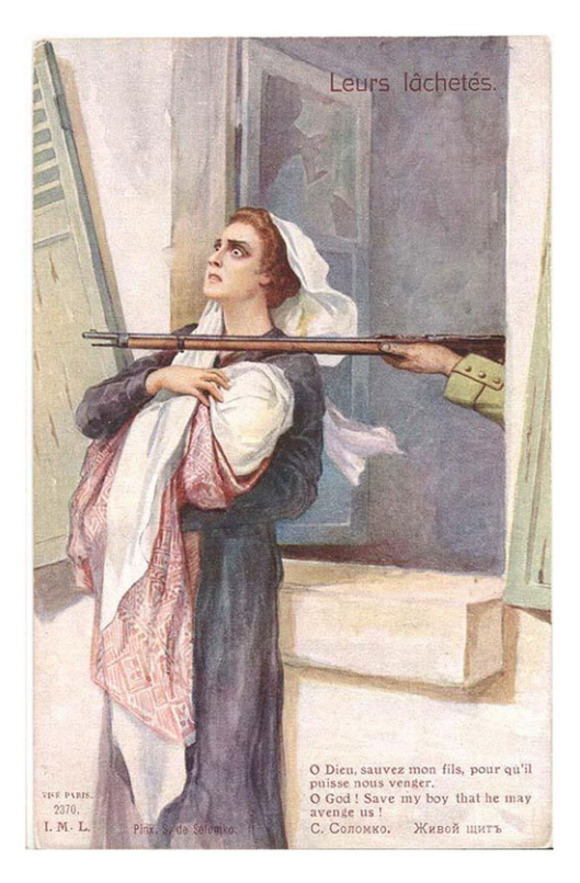
Figure 1. Human Shield, Solomko Sergei Sergeevich, 1916.

namely the ones that would resonate with a shared imagination, and consequently communicate to an audience what the text/event is about.