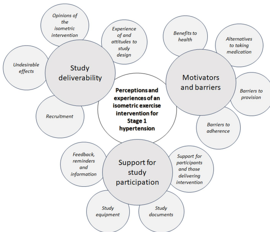
Fig. 3 Summary of emerging themes and sub-themes

conditions limiting exercise ability, e.g. disability, knee or back problems. However, sample participants who experienced these problems did not find this a barrier. Interestingly, some participants experienced anxiety measuring their own blood pressure both alone and when being observed. White coat hypertension is defined as raised blood pressure in a clinic due to stress of this environment, leading to a higher blood pressure reading than would normally be experienced at home (with the term white coat referring to a healthcare professional).