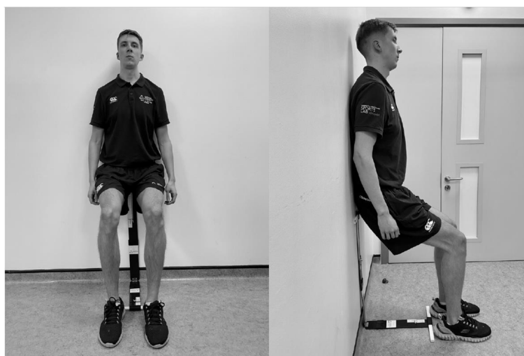
Fig. 1 Isometric exercise intervention wall squat

An embedded qualitative study was conducted as part of a multi-centre randomised controlled feasibility study conducted within NHS settings (primary care, secondary care and in pharmacy settings) in southeast England [32]. In summary, the randomised controlled trial consisted of a parallel group design, randomising participants 1:1 after screening to confirm stage 1 hypertension using home BP readings to either a control group receiving standard care lifestyle advice or an intervention group receiving standard care lifestyle advice plus an isometric exercise programme. Standard care advice consisted of verbal advice from the healthcare professionals conducting the visit and a leaflet containing NHS-approved advice (Supplementary file 1_Standard care advise leaflet). Participants included those over 18 years, with stage 1 hypertension, not on anti-hypertensive medication and without significant medical contraindications. The isometric exercise intervention consisted of a 6-month programme of static wall squats (Fig. 1), the intensity of which was tailored to the individual in an incremental isometric exercise test [33] delivered by a healthcare professional with intensity maintained using a measure device (bent and squat device, Fig. 1). Wall squats were conducted at home by participants in four bouts of 2 min with 2-min rests in between, three times a week [32]. All participants measured their blood pressure and heart rate at home at 4 weeks, 3 months and 6 months using