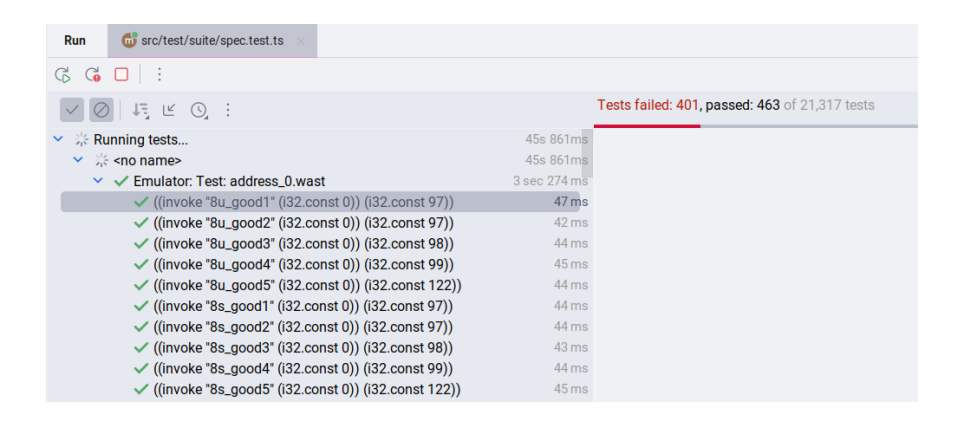
Figure 2: IDE integration in WebStorm [28].

The analysis mode can be configured with a minimum and maximum number of runs. Since we consider all tests as flaky, we will execute each test at least the minimum number of times. If the test reports the same result for each of these runs, Latch assumes it is not flaky and stops for this scenario. In the other case, we already have proof that the test is flaky, and Latch will continue executing up to the maximum number of times to get a more representative measure of the flakiness. The maximum number of runs is important to have statistically significant results, and can therefore be configured by the user for each run. The minimum and maximum number of runs can be configured by the user. When a test suite is executed on multiple platforms, flakiness is measured for each platform separately. At the end of the analysis run, Latch reports the global flakiness of the test suite for each platform for each test and gives an overview with the overall flakiness of the test suite for each platform separately and all platforms together.