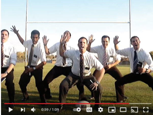
Figure 1. Screenshot of mormon missionary haka video, Wangaratta, Australia.

black name tags. (see Figures 1 and 2 ). 3 In the beginning of the video, they are in a haka line about to prepare for the 'act'. In a very strange way one points to the sky, and another bows his head. This is followed by his head going everywhere, side to side, with an attempt at whetero (protrusion of the tongue) that would be better achieved by keeping his head still. They collectively attempt to wiri with their hands stretched out like starfish. In the middle of this, their kaitataki (haka leader) emerges from the back of the