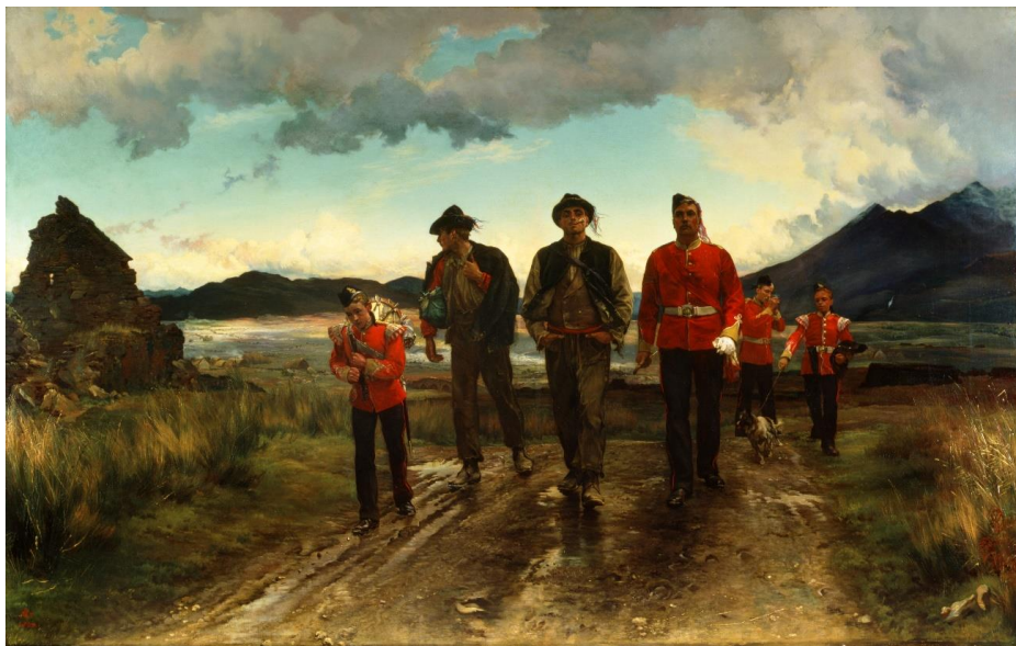
Figure 1: 'Listed for the Connaught Rangers: Recruiting in Ireland, 1878. Oil on Canvas, 107 x 169.5cm.. © Bury Art Museum & Sculpture Centre / Bridgeman Images