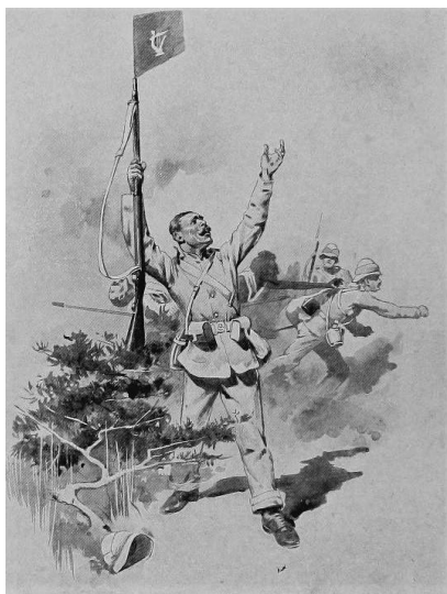
Figure 3. Frontispiece, The Green Flag and Other Stories of War and Sport (1905)