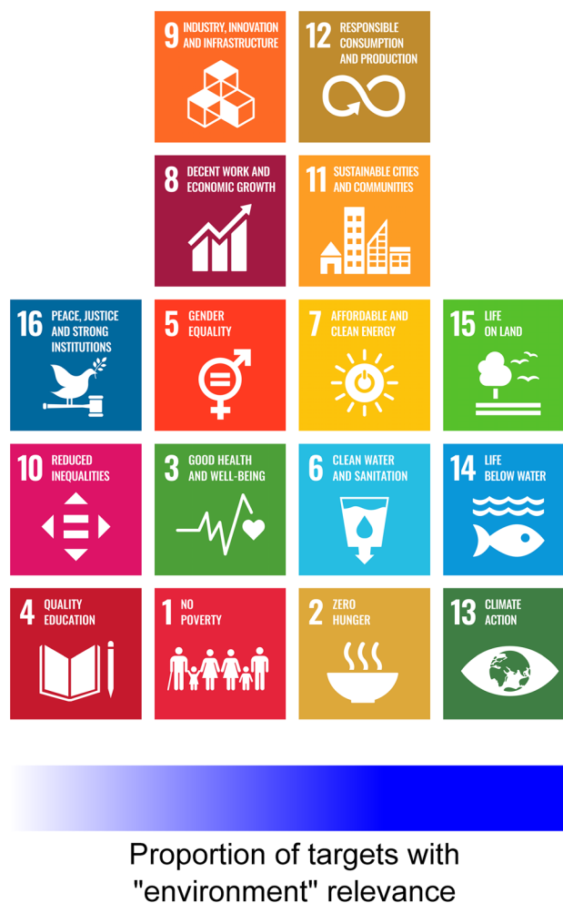
Fig. 2 The importance of environment within each SDG, based on a textual analysis of SDG target wording (as per UN 2015). The vertical scale is linked to the proportion of targets within each SDG that contain at least one environment-related word (Environment-related words were counted within each SDG target, and include: air, animal, aquaculture, aquifer, biodiversity, clean energy, climate, coastal, communicable disease, drought, dryland, ecosystem, environment, fauna, fish, flood, flora, forest, genetic diversity/resources, green space, hepatitis, lake, land, livestock, local product, malaria, marine, mountain, natural, nature, neglected tropical disease, ocean, pastoralist, peri-urban area, plant, renewable energy, resource, river, rural area, sea, seed, services, soil, species, terrestrial ecosystem, tuberculosis, water, weather, wetland, wildlife. The count included close relatives of each word, e.g. *fish* also selected fishing, fisheries, overfishing, etc.), and ranges from no mention of the environment (SDGs 4, 10, 16) to environment mentioned throughout (SDGs 13, 14, 15)

To assess the environment–human aspects of the interactions between SDGs, we applied the logic explained above but focused only on action related to the environment–human linkages rather than the full range of possible actions to advance any one SDG. For example, some action used to achieve good health and wellbeing (SDG 3) is related to the environment–human linkages, e.g. vector