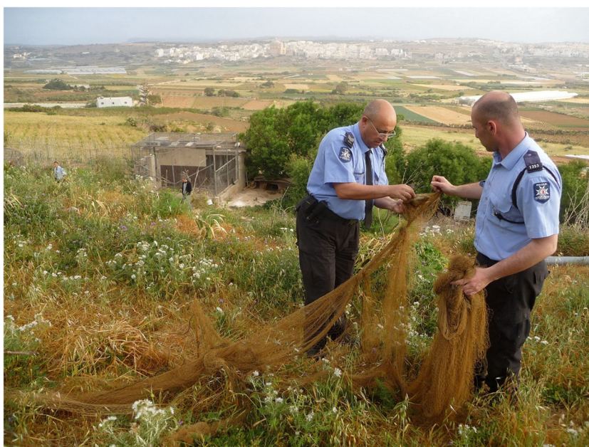
Fig. 3 Administrative Law Enforcement agents dismantling clap-nets from an illegal trapping site.

ALE agents also resent the methods NGOs use to force their constant presence in the field when volunteers spot something illegal or get into trouble - typically through anonymous calls at odd hours reporting illegal shootings,