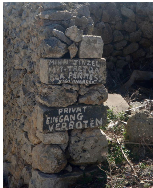
Fig. 2 Sign at the entrance of a field in the Maltese countryside. Caption Reads: [Maltese] Who uses this country lane without permission will be fined; [German] Private. No Entry. Prohibited.

Suddenly, the man reaches for his phone. A brief conversation and he rushes across the field and starts to dismantle the nets. The activists urge their companions to hurry: obviously, someone had spotted them and informed the trapper. Back in the field, the man gives up trying to secure his nets. Nervously,