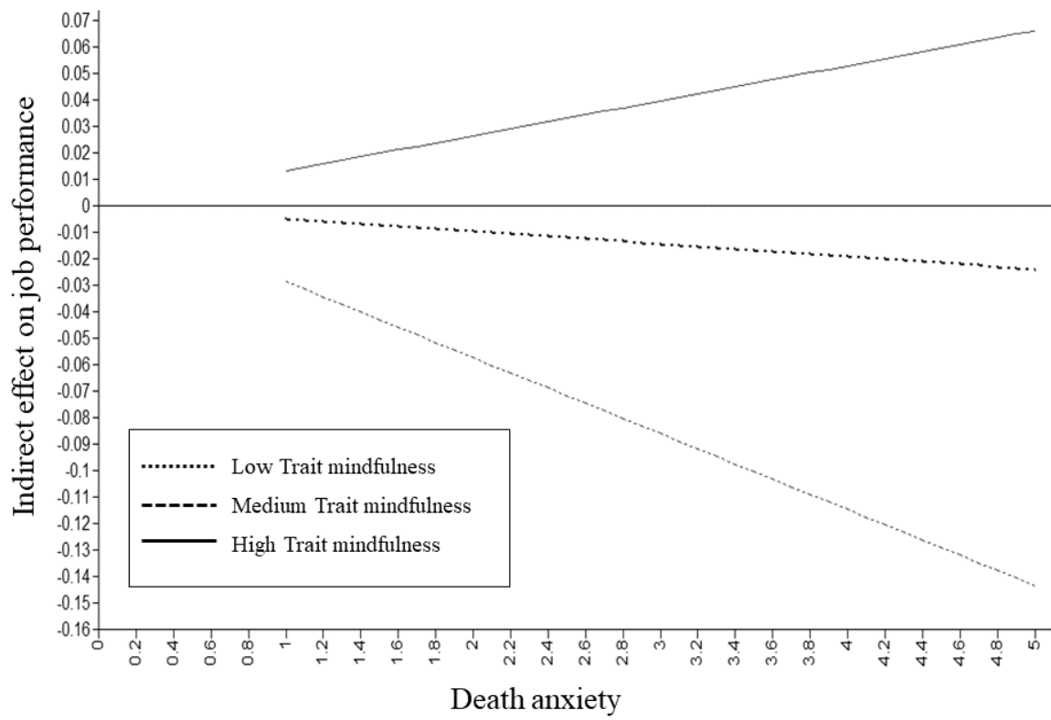
Figure 2. Moderated mediation effect on job performance via energy and work drive