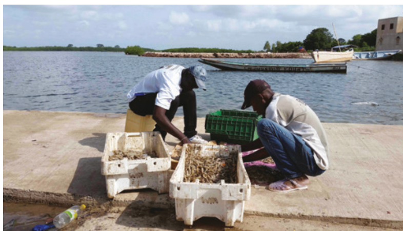
Figure 7.2 Artisanal fishing in the Saloum Delta (September 2019).