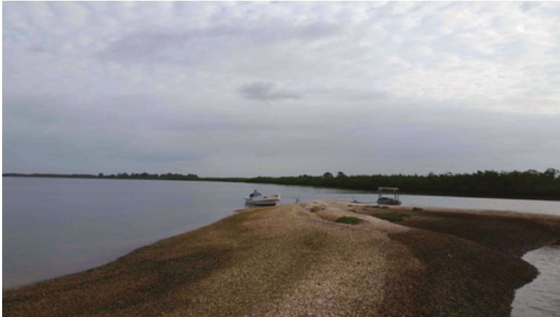
Figure 7.1 Saloum Delta, with its inseparable natural and cultural elements.

(Larsen and Wijesuriya, 2015). In 1992, the year that the notion of cultural landscape was introduced, explicit references to the interactions of humans with their environment were removed from the natural heritage criteria. Indeed, the criteria for assessing and inscribing sites on the List still follow this strict divide between cultural and natural heritage. How can a cultural landscape, supposedly representing the interface between natural and cultural values, only be listed under one of these two sets of criteria? It causes confusion, as exemplified at the Saloum Delta. The implementation of this concept therefore runs counter to its spirit and definition. This continuous divide is exacerbated by the two organisations separately assessing heritage sites nominated for inscription: ICOMOS for cultural heritage and IUCN for natural heritage. According to some, the divide is here to stay (see for example Liley, 2013). However, aware that, as expressed by Phillips (2005), ‘the separation of the cultural and natural world – of people from nature – makes little sense’, IUCN, ICOMOS and the International Centre for the Study of the Preservation and Restoration of Cultural Property (ICCROM) have implemented projects and training activities to bridge the divide. But despite these laudable projects, the case of the Saloum Delta illustrates that the bounded concepts of ‘nature’ and ‘culture’ continue to define heritage.