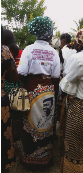
Figure 6.2 Capulana featuring Josina Machel, Mozambican Women's Day, Inhambane (7 April 2019).

and as the natural ruling party of the country, through building continuity with the past and with the foundation of the nation (see Jopela, 2017: 318 for similar findings on the uses of the past by FRELIMO). This intangible heritage manifestation contributes to justifying the longevity of the party, its power, and its central space in the nation. In a multi-party democracy, it is part of a process of discrediting other political groups (Souto, 2013). The party in power is able to keep full ownership of the liberation discourse and movement, while silencing and delegitimising other liberation movements (Coelho, 2013: 28).