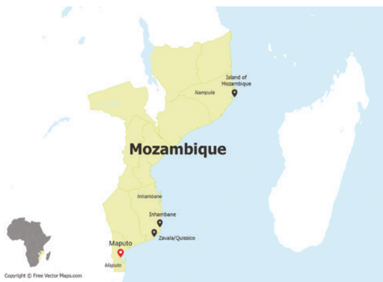
Figure 1.1 Map of Mozambique with the locations of the activities. Original map courtesy of www.freevectormaps.com , revised by Francesca Giliberto.

More specifically, the programme ‘Strengthening Cultural and Creative Industries and Inclusive Policies in Mozambique’ was implemented between August 2008 and June 2013 in the Nampula, Inhambane, and Maputo regions. With a budget of US$5 million, it was executed by UNESCO (as lead agency), the Food and Agriculture Organisation (FAO), the UN Refugee Agency (UNHCR), the International Labour Organisation (ILO), and the United Nations Population Fund (UNFPA). Its official aims were to promote community-based cultural tourism through setting up four pilot cultural tourism tour packages. Two were prepared on the Island of Mozambique, a World Heritage site in the north of the country, and two in Inhambane city in the south, with the hope that they could be replicated in other parts of Mozambique as well (see Figure 1.1 ). Large-scale capacity-building was also provided, to boost the quantity and quality of cultural goods and services, with the intention that these would lead to increased market access and better income generation in tourism-related sectors (such as restaurants, craftsmanship and the creative industries). To ensure that the capacity-building activities were comprehensive and inclusive, the