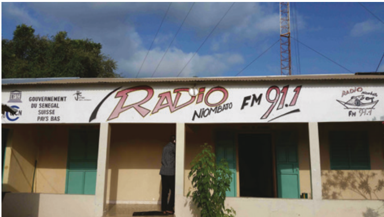
Figure 6.1 Community radio, Toubacouta.