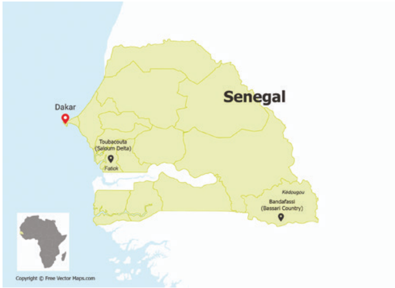
Figure 1.2 Map of Senegal with the locations of the activities. Original map courtesy of www.freevectormaps.com , revised by Francesca Giliberto.

garden, with some surplus sold to tourists. Tourists would be housed in huts, could visit ethno-cultural spaces reproducing the architectural techniques of each local minority, and buy local crafts from an exhibition space. Fonio (the Senegalese couscous) and shea (a tree whose seeds are used to produce shea butter) were identified as two promising sectors, whose growth would be piloted from the community village.