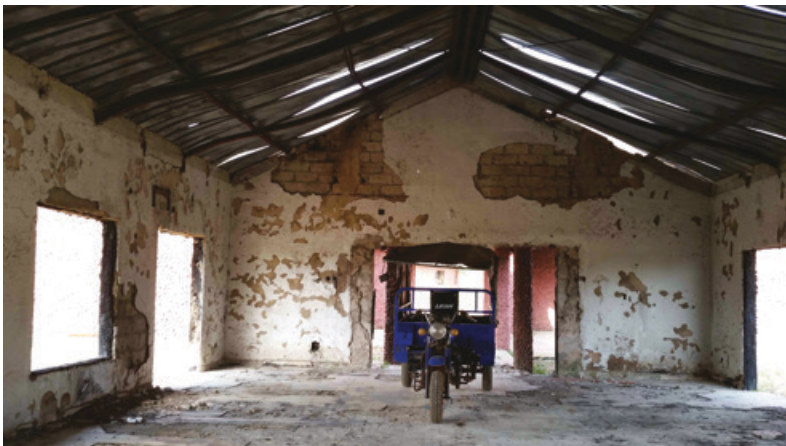
Figure 5.2 Community radio, administrative, and meeting spaces, community village of Bandafassi (November 2019).

domination (by international actors) and resistance (by locals), despite what previous research has highlighted (see for example Escobar, 1995). In addition, a key ingredient for the ‘success’ of projects is local consensus and agreement, which helps to channel power relations towards a common vision for implementation (Mosse, 2005: 232). However, interviews with stakeholders in Dakar, Toubacouta and Bandafassi revealed different, and sometimes even contradictory, understandings of the initiatives, and a lack of translation of the plans and intentions into coherent