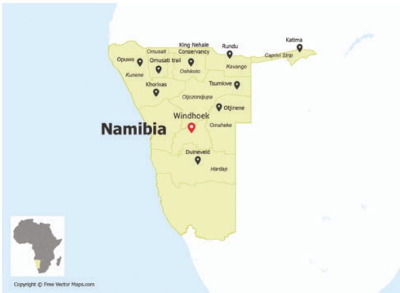
Figure 1.3 Map of Namibia with the locations of the activities. Original map courtesy of www.freevectormaps.com , revised by Francesca Giliberto.

Linked to the liberation struggle or the post-colonial period, these fully equipped heritage/interpretation centres housing new exhibitions intended to transform the map of tourism, and to move away from its sole focus on the colonial history of Namibia (at sites such as Swakopmund, Lüderitz, and Henties Bay), as a vehicle for poverty reduction, particularly among women and other disadvantaged and vulnerable groups. To ensure such a transformation, various committees were set up, including ministries, national government institutions, regional and local government and community representatives. Capacity-building training was provided focusing on topics that included tour-guiding and producing, marketing and selling traditional handicraft. In addition, the ‘Start Your Cultural Business’ training efforts aimed to expose a large number of individuals to the entrepreneurial opportunities around cultural heritage utilisation across the country. To ensure gender equality, at least