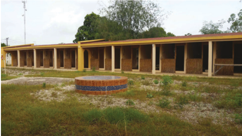
Figure 5.3 Empty craft space in Toubacouta.

of key decisions (as recommended for instance by Sofield, 2003). Visas have not been required of some Europeans, particularly French people who are the main tourists to Senegal, representing around 30 per cent of all the international tourism entries (AD Conseil, 2015: 71). However, tourism growth in Senegal has been negatively affected by entangled external and internal factors. Security issues, diplomatic relations with European countries, and the rules of reciprocity may lead to the requirement for tourist visas being reinstated. The Bassari Country is still not a very touristic place: it is far from the capital, infrastructure is lacking, and it is only accessible by a long road trip. Many foreigners also consider it to be too close to Mali, and therefore potentially dangerous. The Saloum Delta is suffering from climate change and overfishing, which had led to a decrease in fishing tourism (see Chapter 7).