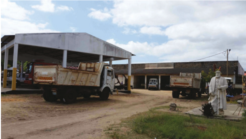
Figure 5.4 Statue of Vasco da Gama at a garage in Inhambane.

Gama, who stopped there on his way from Portugal to India in 1498, has been moved to the courtyard of a garage (see Figure 5.4 ). Although it is hidden, it is still a stop on local tours. If the government's primary motivation were anti-colonial, it would have been easy to destroy the statue. Although a number of colonial statues were demolished or damaged just before and right after Mozambique's independence, in a second period, the government has aimed to preserve some of these statues. For some, the aim of such an approach is to configure a national identity that has fewer voids, and requires both memory and oblivion (De Sousa, 2019).