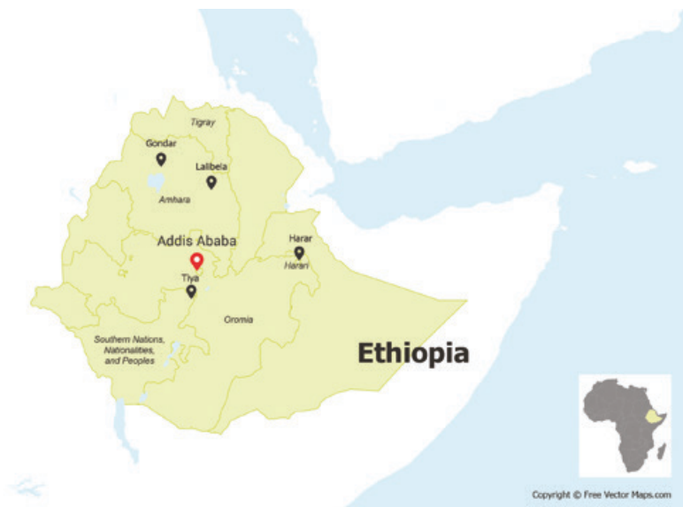
Figure 1.4 Map of Ethiopia with the locations of the activities. Original map courtesy of www.freevectormaps.com , revised by Francesca Giliberto.

Finally, 'Harnessing Diversity for Sustainable Development and Social Change in Ethiopia' ran from July 2009 to December 2012. Implemented in Addis Ababa, Amhara (particularly in Lalibela and Gondar), Tigray (for instance in Wukro), Harar, Oromia, and the Southern Nations, Nationalities, and Peoples (particularly in Tiya) with a budget of US$5 million (eventually reduced to $3,576,632), the project was coordinated by UNESCO and UNDP (see Figure 1.4 ). It aimed to promote cultural heritage and diversity, as well as to develop creative industries and encourage dialogue about environmental preservation among the country's diverse communities. The activities promoted inter-faith and community-based dialogue, with a focus on the needs of minority, marginalised, and disadvantaged groups. Like the other three selected projects, various capacity-building activities were rolled out, with the ultimate objective of poverty reduction. Training courses