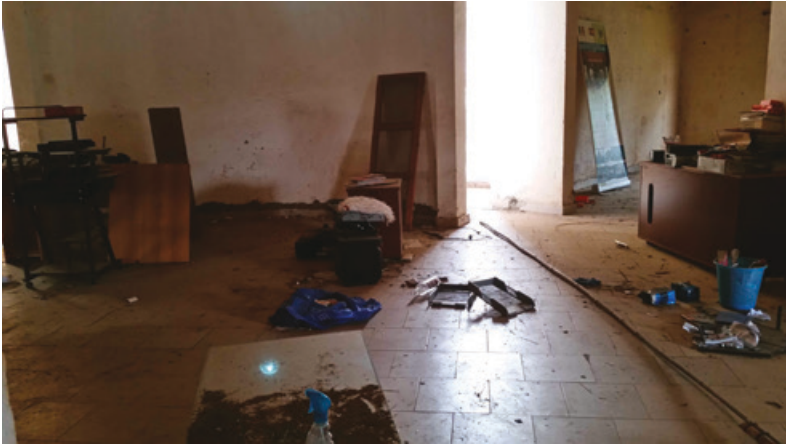
Figure 5.1 Hut for artists and artisans, community village of Bandafassi (November 2019).