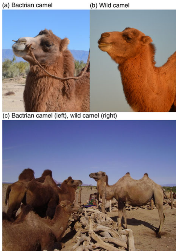
PLATE 1 Morphological differences between the Bactrian camel Camelus bactrianus , in part (a) and individuals to the left in (c), and wild camel Camelus ferus , in part (b) and individual to the right in (c). Camelus ferus has smaller, pyramid-shaped humps, a smaller body, slimmer legs and a flatter skull.