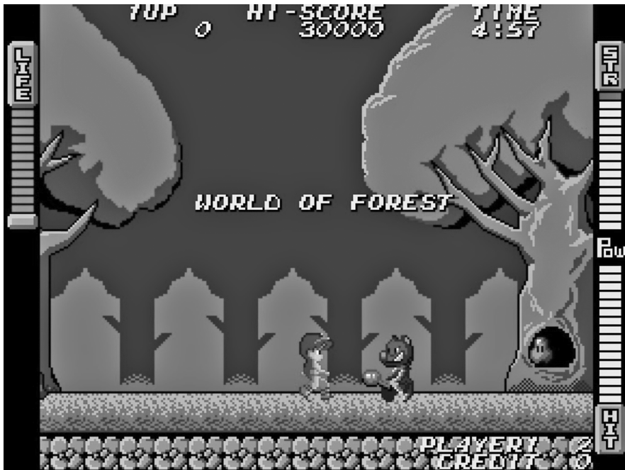
Figure 1.1 Screenshot of Princess Athena as a new game begins in Athena (1986).

confer the power of flight. It is tempting to think that Athena's reference to Icarus, its shield-shaped mirror and its Pegasus-wing item influenced Kid Icarus . 30 Yet, they appeared only three months apart, 31 so developers more likely adopted widely known tropes, particularly from the 1981 movie Clash of the Titans , independently. 32 Other magical items are vaguely ancient: the Shell Necklace transforms Athena into a mermaid, an oil lamp lets her 'find' the correct World through each World's alternative exit 33 and a chest named Pandora's Box lets her defeat Hell World's boss. The mirror, necklace, lamp and chest suggest a girlish interest in personal adornment, offsetting Athena's conventionally masculine armour and weapons.