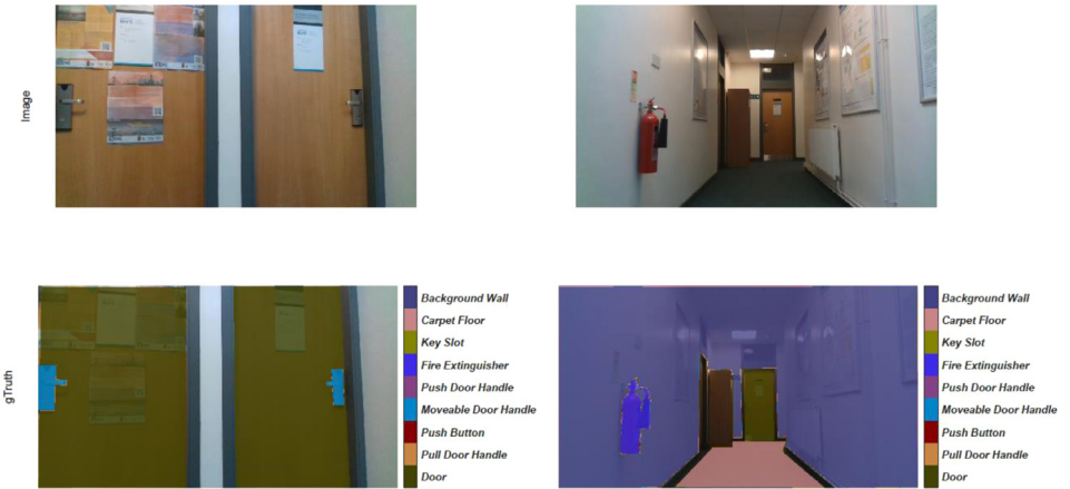
Fig. 3. Examples from the collected dataset with the first row representing the images and the second row representing the corresponding pixels annotations.

scaling can be employed to overcome any potential limitations during training. Although the dataset can be used individually, it can also be combined with other datasets to enhance the objects' diversity and increase the number of objects instances.