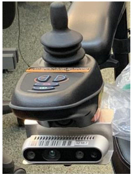
(b) Intel® RealSense Camera