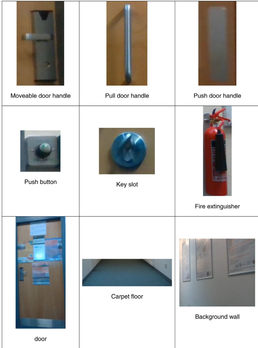
Fig. 2. Indoor classes of interest of the proposed dataset.

Images extracted from the one-minute video are annotated manually by the first author and verified by the second. The dataset has 1549 images with image sizes of 960 \times 540 \times 3 . Examples of the collected data with the ground truth annotation are shown in Fig. 3. Pixels that do not fit in any of the eight predefined classes are assigned to the Background wall class. However, small areas between two different classes, such as door frames, are kept unannotated. These pixels cannot be fit in the Background wall class as they belong to a different category of objects.