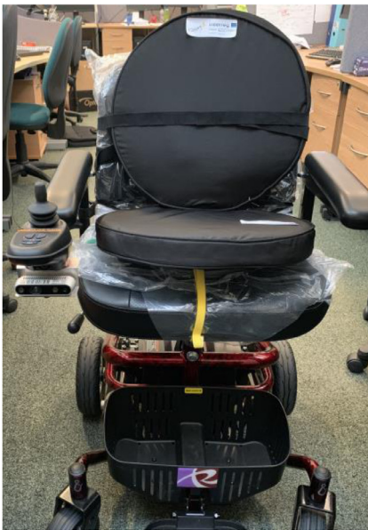
(a) Roma Reno II EPW

The proposed dataset is introduced to fill the gap of lacking project-specific indoor objects of interest that a user may need to interact with on a daily basis (our project targets powered wheelchair disabled users). The system setup that has been used to collect the dataset is shown in Fig. 1. We focus on objects that can represent visual cues for visually impaired users or objects that disabled users may need to approach for further manipulation. These object categories are doors, floors, background walls, fire extinguishers, key slots, switches, and different kinds of door handles (push, pull, and moveable door handles). Fig. 2 shows the classes of interest of the proposed dataset. There are some publicly available datasets such as ADE20K [1,2] and SceneNN [3]. However, these datasets do not cover infrequent objects such as different kinds of door handles.