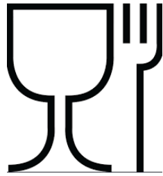
Food and drink