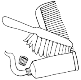
Personal cleanliness and comfort