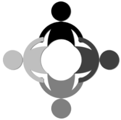
Social participation and involvement