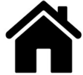
Clean and comfortable home