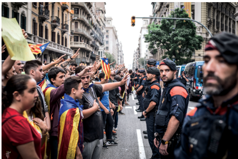
Barcelona, Spain—October 3rd, 2017, Aftermath of the Catalan independence referendum