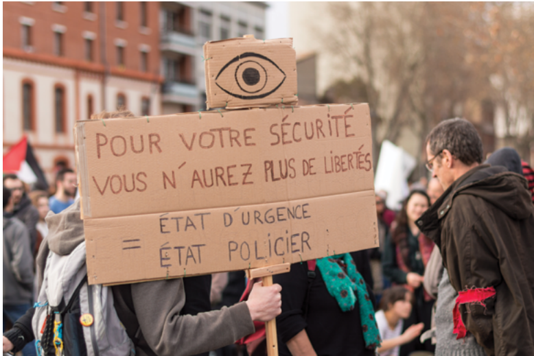
Etat d'urgence. Gyrostat (Wikimedia, CC-BY-SA 4.0)