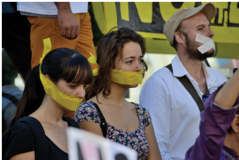
Madrid, Spain—November 1st, 2014, Gag laws.

Enough! For a new legislation that guarantees human rights', issued by Amnesty International Spain and backed by over 260 organizations (Amnesty International 2020). As noted by the Commission's 2021 report (2021: 18), in response to civil society pressure, the Constitutional court reviewed some of the contested articles of Organic Law 4/2015 in 2020 (such as the sanction provided by Article 36.23 of the Law which prohibited "the unauthorized use of images or data of authorities or members of the Security Forces of the State" (BOE 2020) which was in breach of article 20.2 of the Spanish Constitution (freedom of expression and information). However, according to the latest available annual statistics (Anuario Estadístico 2019), the articles most used to sanction citizens under this Law were not among those reviewed by the Constitutional court. 35