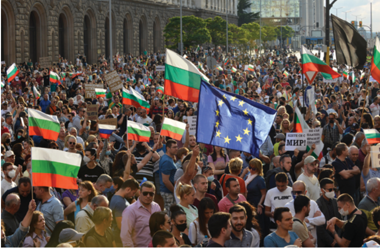
Sofia, Bulgaria—Jul 14 2020, People protesting on the main streets in the capital and demanding PM's resignation.

This misconception was reinforced by Justice Commissioner Reynders during the debates held at the European Parliament on 5 October 2020 , when he stated: “The necessary structures are essentially in place, but Bulgaria has to make them deliver results more efficiently” (EP 2020b). This is a dangerously wrong diagnosis: as stakeholders and scholars have persistently explained, including in direct communication to Commissioner Reynders, the structures themselves are part of the problem. 51 These specialised bodies stand outside the ordinary legal framework, circumventing due process, and are being deployed by the powerful of the day to consolidate their power and deepen the symbiosis between mafia and state. This enables the arbitrary use of power and is hence a direct assault on the rule of law, whose raison d’être is the prevention of tyranny.