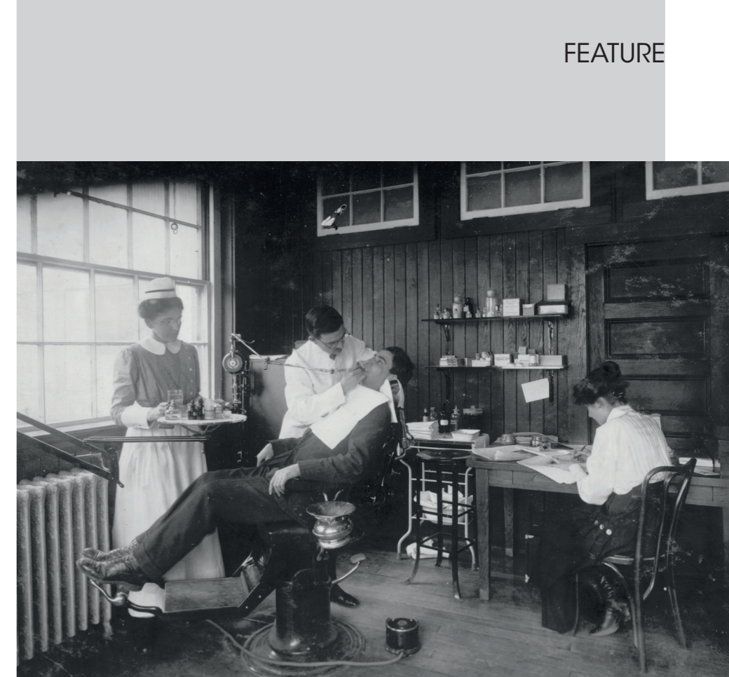
Fig. 2 Assisted by a dental nurse, a dentist looks in the mouth of a male employee of the Hood Rubber Company, Cambridge, Massachusetts, USA, 1917

In 1902, Local Education Authorities were set up. This was followed in 1904 with the