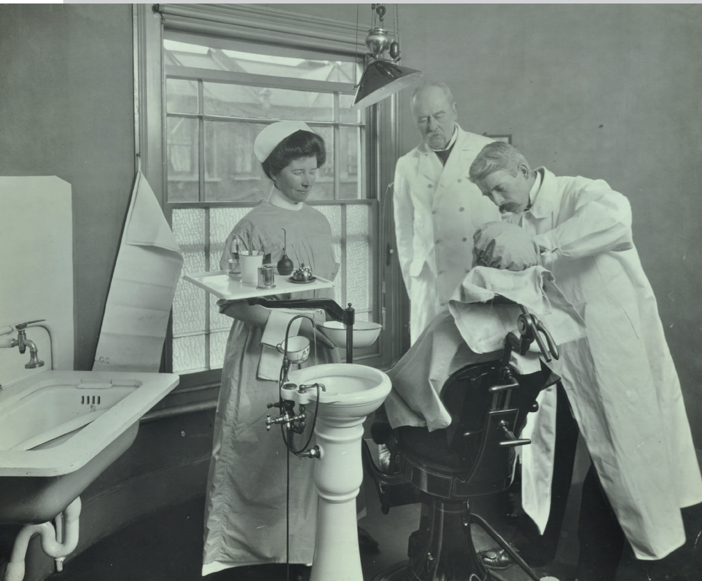
Fig. 3 Dental Room, Woolwich School Treatment Centre, London, 1914. A dentist in the act of extracting teeth, with apparatus ready and an anaesthetist and dental nurse standing by

‘During World War II trained, experienced dental nurses were recruited and employed by the armed forces.’