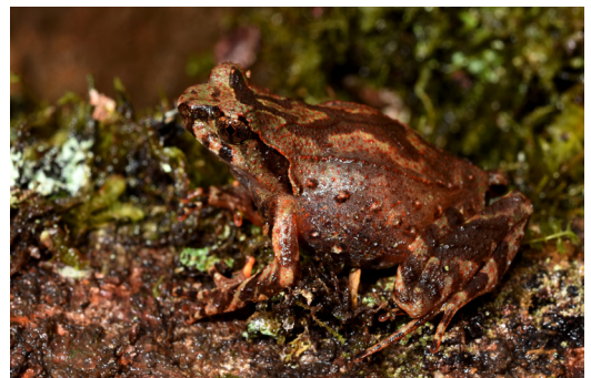
Figure 1. Female Megophrys rubrimera (AMS R186128) in life.