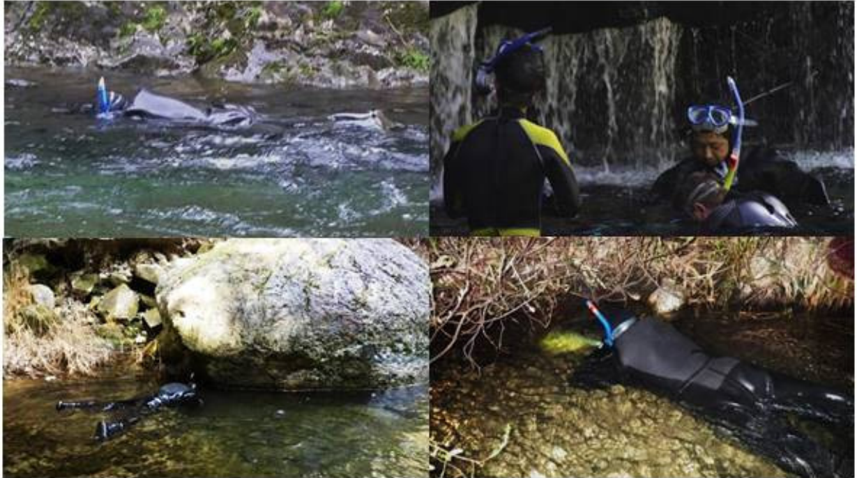
Figure 1. Snorkeling can be used during daytime and nocturnal surveys and can help to find individuals as well as locate suitable trapping sites.