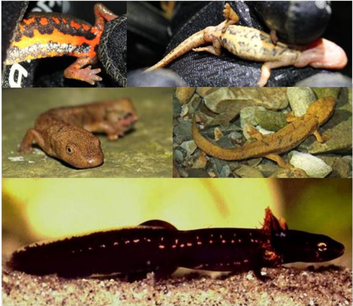
Figure 6. The Warty newt can be found sharing Chinese giant salamander habitat. The picture on the far right is the larvae of this species and should not be mistaken for CGS larvae. Image of larvae © Henry Janssen

Warty newts ( Paramesotriton species), can grow up to 20cm total length. They have a rougher skin than the CGS and their skin is not slimy. Colour varies from species to species but they have black markings on the underbelly and sometimes the belly is orange to red. The larvae can grow to 4cm and are black with a characteristic yellow/white ring around each eye and yellow/white tips to the external gills.