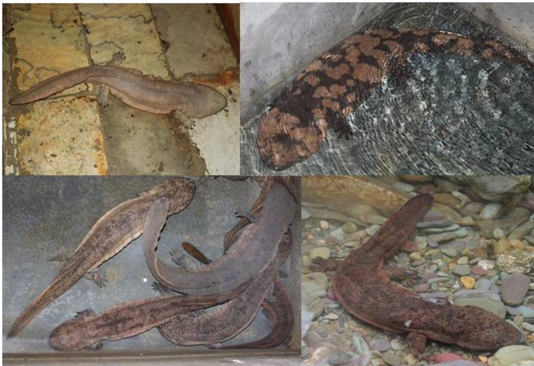
Figure 5. These pictures demonstrate the variation in colour across individuals of Chinese giant salamanders.

Chinese giant salamander adults: These grow up to 1.8m in length and can be distinguished from other salamander species by the folds of skin along their flanks which facilitate percutaneous absorption of oxygen. The skin is smooth and mucus is excreted when they are held. Colour is variable and ranges from light brown to dark brown; some have marbled markings of black and brown. They have a large, blunt and flat head with small nostrils and small eyes which lack eyelids.