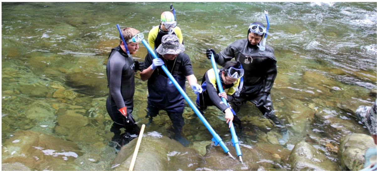
Figure 2. Turning heavy rocks using log peaveys combined with snorkeling during day time surveys will maximise your chance of finding CGS.