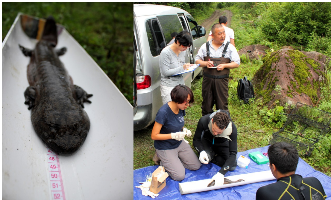
Figure 7. The use of a drain pipe with measure facilitate the collection of morphometric data.