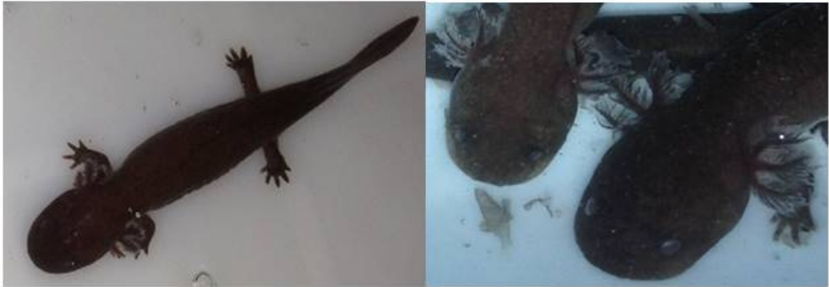
Figure 4. Young Chinese giant salamander larvae with external gills.

Chinese giant salamander larvae measure 2-3cm in total length upon hatching, and they leave the nest at around 4-5cm total length. They have smooth skin with external gills and remain in this form until they metamorphose and lose their external gills at around 20-25cm total length.