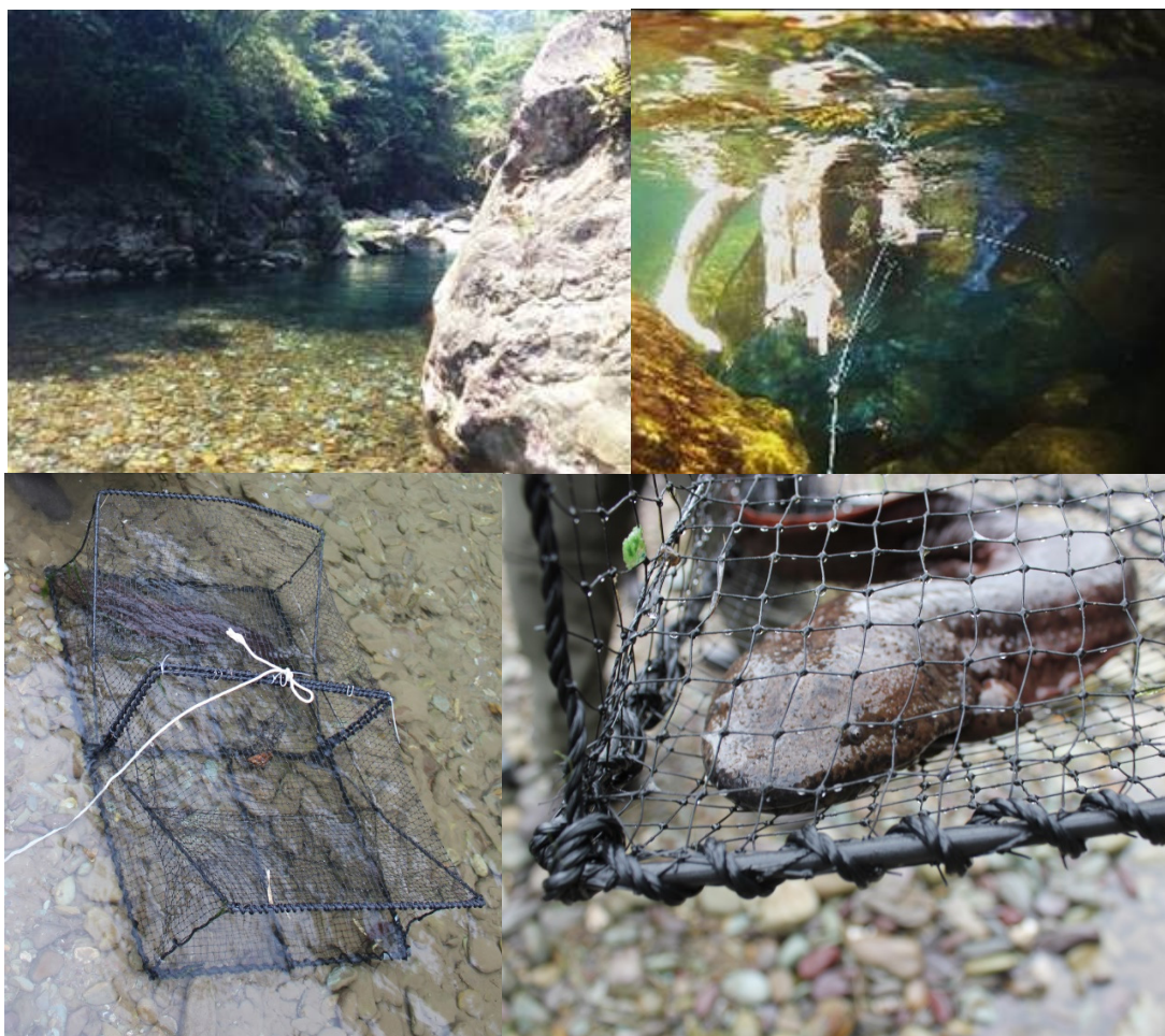
Figure 3. Crab trapping is an effective way of catching salamanders and will help when surveying in low population density.

During night surveys, follow the transect up stream, as lights may startle the CGS and give them an easier route of escape downstream without being detected. The equipment that should be used are nets, waders, wetsuits, snorkel and mask, head torches and dive torches. Walk / wade / swim slowly and scan the river system and look for the CGS, focusing on suitable refuge sites.