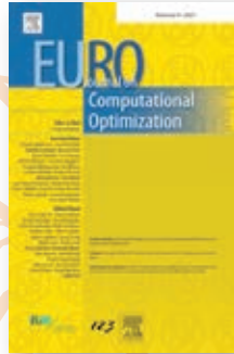
EURO Journal on Computational Optimization elsevier.com/locate/ejco

Published in collaboration with the Association of European Operational Research Societies (EURO)