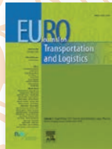
EURO Journal on Transportation and Logistics elsevier.com/locate/ejtl