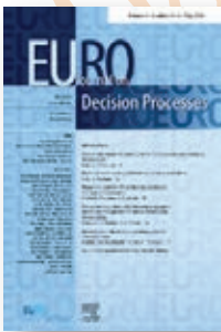
EURO Journal on Decision Processes elsevier.com/locate/ejdp