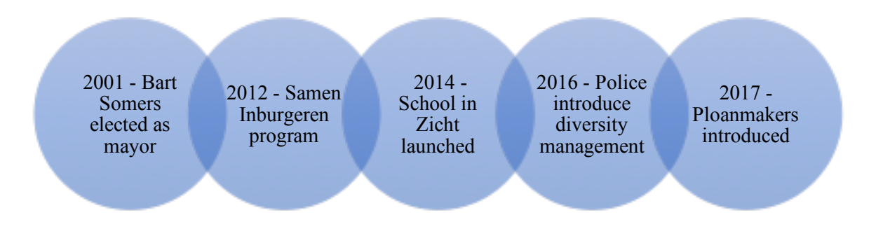
Figure 1: Timeline of Important Policies which have Accounted for the Mechelen's Integration Success

Finally, in 2017, the Somer's administration launched a new housing project titled "Ploanmakers" (Ibid.). It involves recruiting up to ten tenants – dubbed "Ploanmakers" – living in a culturally and socially diverse area (with a high percentage of subsidized housing) who endorse social cohesion among the population and organise community activities. Also, the chosen citizens act as bridge-builders, mediators and help their fellow residents to improve their language skills. In return for their efforts, 'Ploanmakers' are granted lower rent for three years (Ibid.).