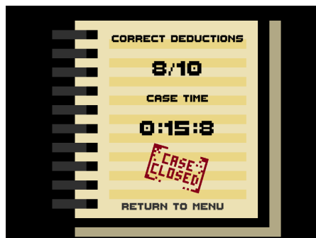
Fig. 5: Case closed as the player has answered sufficient questions correctly on that level to proceed.

If all intuition XPs are gained, the player is shown their score and a notification that they have “closed” the case on that level (Figure 5). This presents an achievement within the game and allows them to progress. If all reputation points are lost, the level is over and the player is shown their score and a notification they have been “fired” by Ginny from the case (Figure 6).