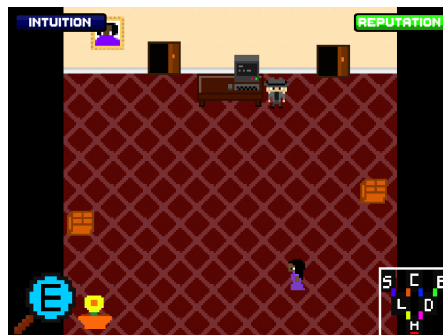
Fig. 2: The game’s 2D interface. The ‘E’ in the bottom left highlights a clue has been found. A mini-map is depicted in the bottom right.

answer to prove to Ginny that she’s up to the task. As Sherry traverses the house, there are also various locked rooms, each room represents a new case that can only be accessed by answering enough questions correctly on the current level.