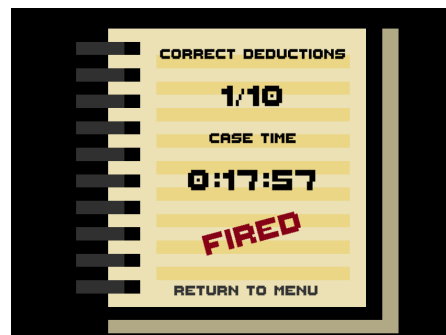
Fig. 6: Player fired due to too many wrong answers on the case (and a full loss of reputation).