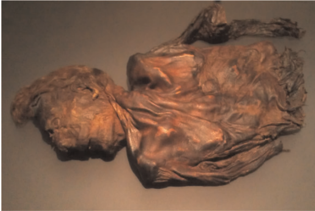
Figure 2. Bog body on display at the National Museum of Ireland, Dublin.

rudimentary watercraft made of cows' skin in search of the Garden of Eden (Roche, 1991). Their dangerous and lengthy journey tested not only their faith but their human endurance. It also challenged the human/animal boundary, as they met along the way many Nonhuman Animals with human characteristics, humans with supernatural powers, and monsters of the deep otherwise unknown to human society. Mortality itself was also uncertain in these ethereal spaces across the sea, as Brendan came upon various sites where youth, abundance, and fertility triumphed over death and decay.