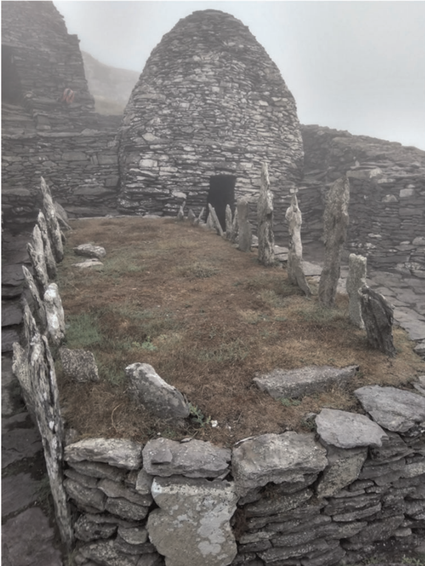
Figure 3. Cemetery and beehive hut on the monastery site.

for this reason (in addition to the spiritual benefits of gardening as a means of maintaining personal purity and independence from regular society) that archaeologists suggest that such extensive garden terracing was constructed. Two worn querns survived on the island, indicating that cereals cultivated on the island were processed in various ways (Franklin, 2011).