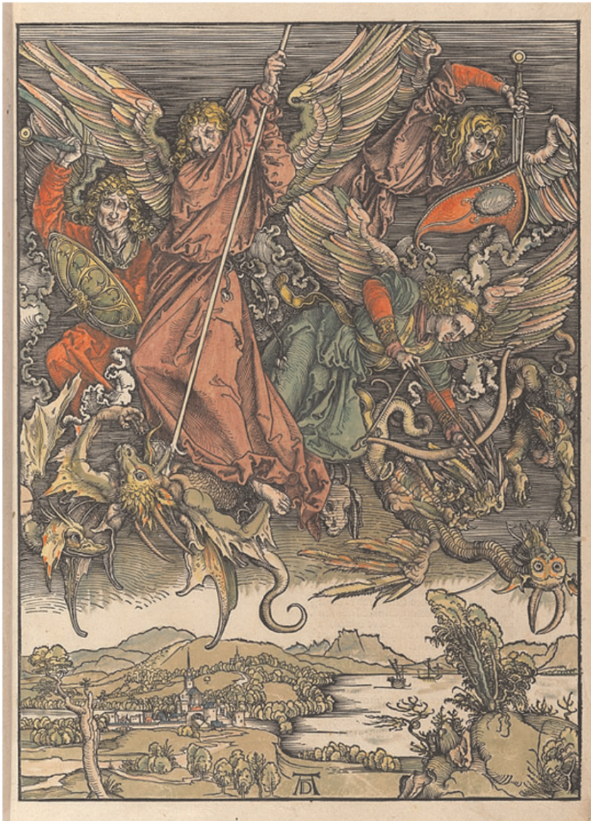
Figure 4. St. Michael and Dragon. Albrecht Durer. 1498. Apocalipsis cu[m] figuris, Nuremberg Typ Inc 2121 A, Houghton Library, Harvard University