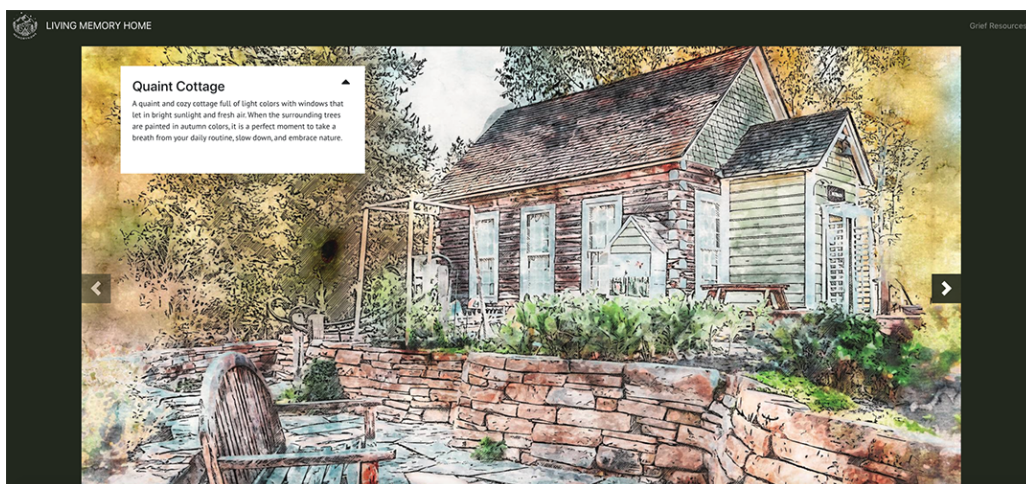
Fig. 3. Living Memory Home selecting home base exercise.

Overall, the LMH was created through a co-design process that incorporated feedback from 4 multidisciplinary experts with research experience in grief study, mental healthcare and medical application development and stakeholders who had experienced the loss of a loved one. The activities and features of LMH (e.g. writing exercises, digital mourning space) were created based on best practices drawn from bereavement and grief literature (e.g., Neimeyer's Techniques of Grief Therapy [56] and Litz's internet-based grief intervention in applying constructs of Cognitive Behavioral Therapy [45]) which were further refined based on the expert's field experiences. In the LMH, users would have the opportunity