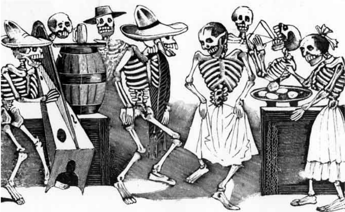
José Guadalupe Posada

Published by the CopySouth Research Group www.copysouth.org