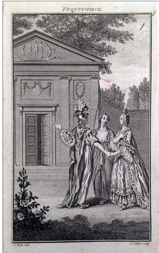
FIG. 1. FRONTISPIECE TO THE LADY'S MAGAZINE FOR 1774.

The 1789 frontispiece epitomises the magazine's self-conceptualisation as a publication uniting the values of female propriety with a projected (pre-Wollstonecraftian) 'revolution in female manners' that would see its female readers and contributors striving to 'excell [ sic ] each other' as much in mental accomplishments ('scientific studies') as much as 'formerly' they did 'in the trifling of dress, and in the arts of dissipation'. 22 This was an ambitious project that the magazine attempted to realise through various mechanisms: the space it gave to the question of women's education and extracts from educational works in the