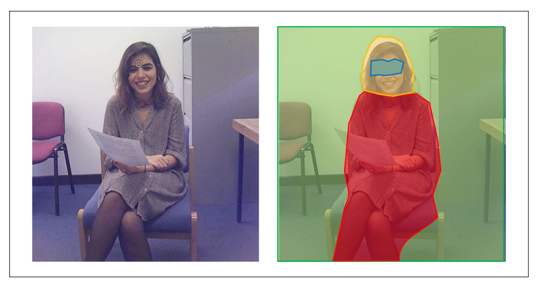
Figure 1. A screenshot of a typical view seen by participants during the experiment, and the corresponding AOIs for that view (eyes, face, body, background).

structure, including crossed random slopes for Group and Perspective within items and crossed random slopes for Perspective within participants. When the model did not converge, the random slopes that accounted for the least variance were removed (as suggested by Barr et al.,